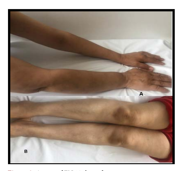
Figure 3. Aspect of EN 10 days after treatment.