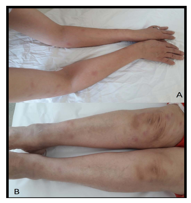
Figure 1. Aspect of EN at admission (A: upper limbs/B: lower limbs).

The patient received a symptomatic treatment consisting of Vitamin C, antihistaminic, emollient and dermocorticoids. 10 days after initial diagnosis, the patient had a slight improvement of the lesions (Figure 3).