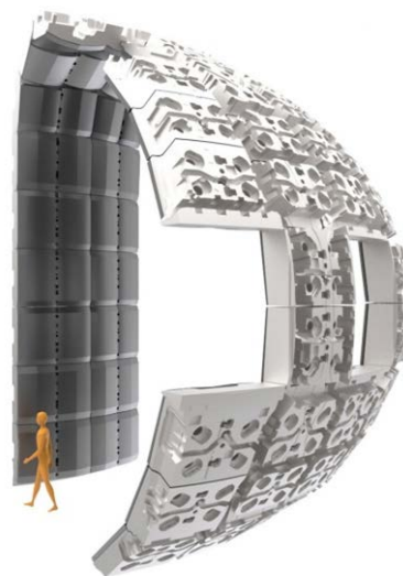
Figure 2. Blanket of the ITER.

Due to its unique physical properties (low plasma contamination, low retention