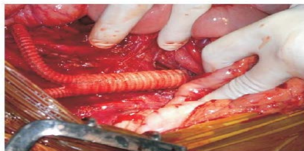
Figure 4. Collagen coated woven polyester Y graft in place.