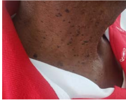
Figure 3. Cervical DPN in a 44-year-old hypertensive.