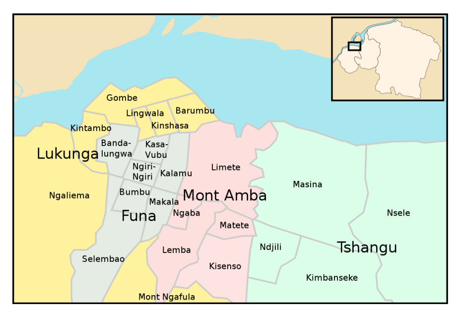
Figure 3. Representation of Kinshasa, its districts and communes.