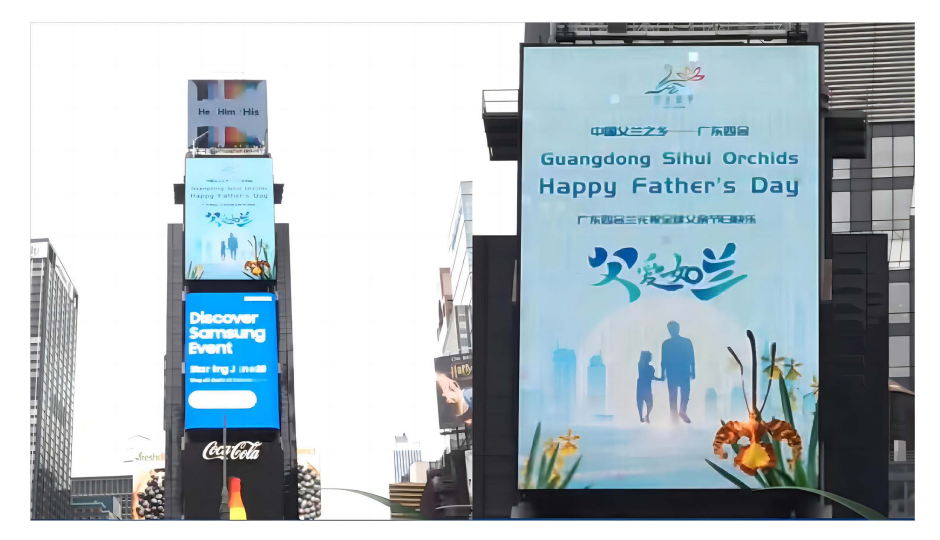
Figure 8. Sihui orchid debuts in New York City's Times Square.

Orchid culture, as a concentration of Chinese traditional culture, has its unique historical and cultural value and humanistic spirit. The development history of the orchid industry in Sihui, the entrepreneurial experience of local entrepreneurs in poverty alleviation, and the support and impetus of the government can be integrated into the interpretation of orchid culture, forming the unique orchid culture of Sihui, and increasing the connotation of the local regional culture. The integration of orchid culture into the design of cultural and creative products can enhance the added value of the products. By using the image of orchids and their meanings in poems and paintings or cultural relics to integrate into the design of structural forms, decorative patterns, and craft materials of cultural and creative products, by using digitalization methods such as VR to develop interactive orchid cultural and creative products that young people like, by using the characteristic regional culture of Sihui to tell the story of the orchid brand,