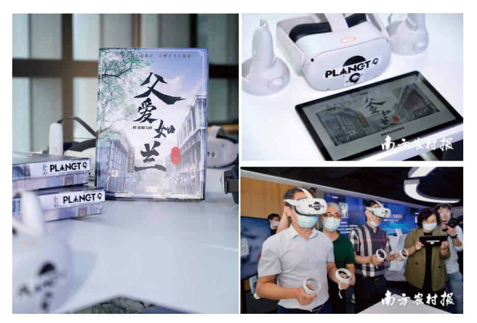
Figure 7. Script control of "A Father's Love is Like an Orchid" in Sihu.

Sihui local independent research and development of a new orchid variety "Qitian Da Sheng", the species is a butterfly orchid, the body is brown and yellow, and the top of the head the three elongated "tentacles", like wears locks of gold armor, wearing a phoenix-winged purple gold crown "! Qi Tian Da Sheng" Sun Wukong, the flower so named. Sihui will take the opportunity of Father's Day 2022 to launch it as the exclusive flower for Father's Day, with "father's love like orchid" as the publicity theme, which is a metaphor for father's omnipotence