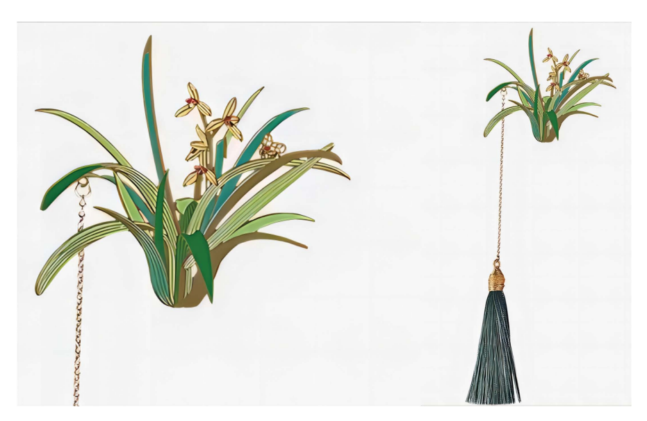
Figure 5. Xi'an Museum cultural creation, Jianlan bookmarks.

The core of cultural and creative products lies in transforming culture and innovation into products (Su, 2014), so mining the core cultural connotation of orchids in Sihui is the focus. By examining and analyzing the cultural and creative products sold by orchid enterprises in Sihui City, this paper finds that most