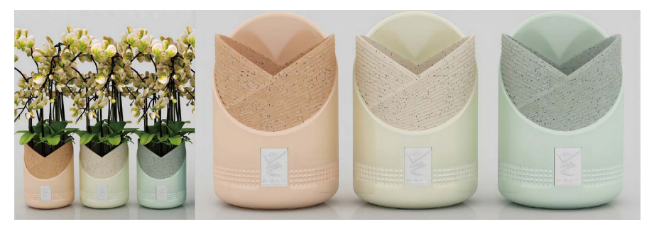
Figure 3. Weng Yuan's "Heart Like an Orchid Pot" design.

The Orchid Cup refrigerator stickers ( Figure 4 ) developed and designed by the Henan Museum were inspired by a set of cups in the museum's collection. There are 12 pieces in total, and one of them has a colorful orchid grass painted on the outer wall of the cup, with a fresh and light color pattern and a white glaze. The designer simplified and extended the orchid pattern on the cups of the museum's cultural relics, combined with the aesthetics and needs of modern life, and designed the Orchid Cup Refrigerator Stickers, a cultural and creative product.