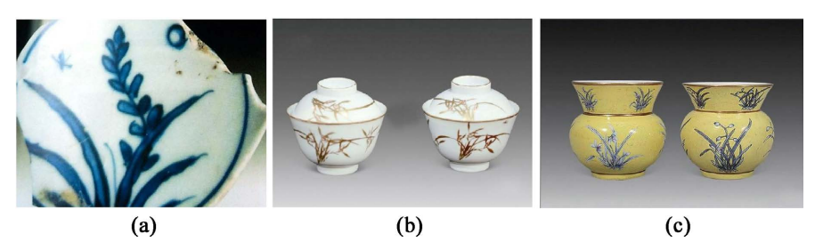
Figure 2. (a) Jiajing Orchid Pattern Porcelain Tablet (Ming Dynasty), (b) Gold-Colored Orchid Covered Bowl (Qing Dynasty), (c) Famille Rose Enameled Orchid Jardinière (Qing Dynasty).