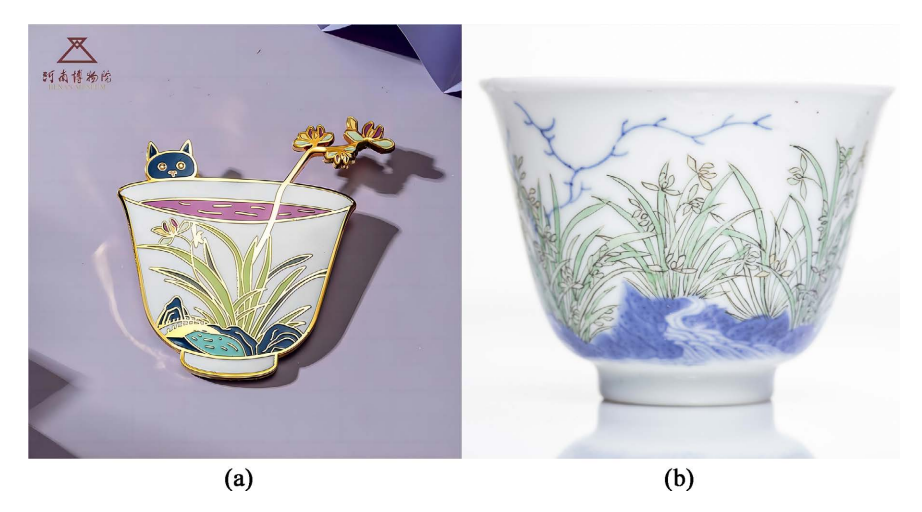
Figure 4. Cultural creation of Henan Museum. (a) Orchid Cup Refrigerator Stickers; (b) Qing Kangxi Orchid Cup (Henan Museum collection).