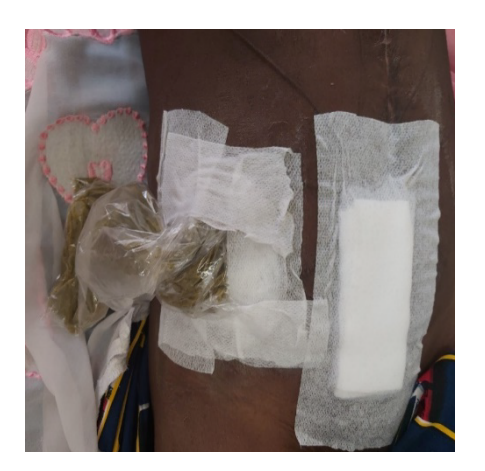
Figure 3. Plastic bag apparatus.

The surgical aftermath of the typhic ileal perforations were grafted with a significant morbidity 57.4%. This could be explained by the type of surgery in the classification of Althémeir where peritonites are classified surgery room. The morbidity observed in this study is similar to that of Niangaly [5] and Ngo Nonga [15] who found 51.5% and 59.6% respectively. On the other hand, it is higher than 13.5% in the study of VIGNON Kc, [16] and lower than 72.2% observed in the study of Ouedrago [17]. Morbidities in the African series vary widely from study to study, depending on whether the study is in rural or urban settings.