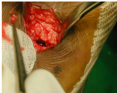
Figure 4. Intraoperative view of the pseudarthrosis focus on the right.