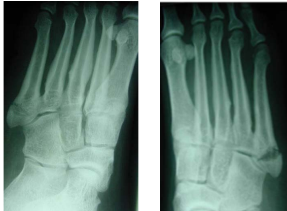
Figure 2. Radiographic aspects of lesions with tight non-union on the left and loose on the right.

under anesthesia spine and pneumatic tourniquet placed at the root of the member. The operating technique was identical for both sides. The approach was posterolateral curvilinear. The banks of the fracture were revived and the medullary canal re-stabilized ( Figure 4 and Figure 5 ). After interposition of a spongy graft taken from the left iliac crest, screwing with a malleolar screw was performed. The post-operative radiographic checks were satisfactory ( Figure 6 and Figure 7 ). The operating suites were simple. After a 9-month follow-up, a consolidation was obtained with painless feet allowing the patient to return to work.