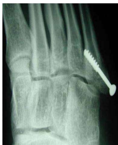
Figure 6. Post-operative control of reduction and fixation on the left.