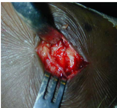
Figure 5. Intraoperative view of the pseudarthrosis focus on the left.