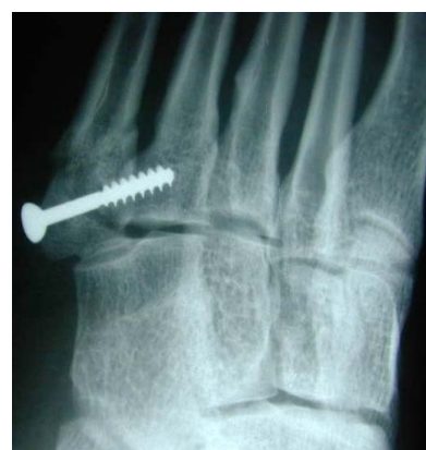
Figure 7. Post-operative check of reduction and fixation on the right.