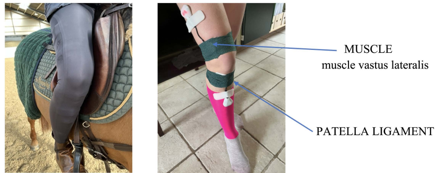
Figure 1. Placement of the 50 mm and 20 mm AMG sensors on the muscle and ligament of the rider's leg.