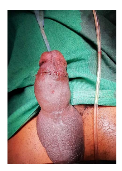
Figure 4. Skin incision sutured (Picture by Dr Ofori).

of follow-up with an uneventful recovery. No voiding or erectile dysfunction has been reported so far. Patient's IIEF score in the area of erectile function was 27 indicating no erectile dysfunction.