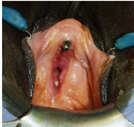
Figure 1. Type I complete transection (urethra section close to the cervix, the fistulous orifice and the vagina remain flexible).