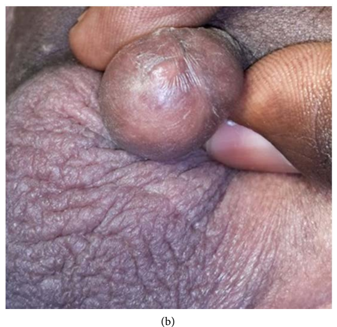
Figure 1. (a) Complete meatal stenosis in a 3-year boy following glans penile amputation from guillotine circumcision; (b) Complete meatal occlusion in a 5-month-old boy following glans amputation from Plastibel circumcision.

These two patients have been followed up over the period and we present the cosmetic and functional outcomes ten years post-surgery. Questions about the durability of the functional and cosmetic outcomes of such a novel procedure in the long term have necessitated this update.