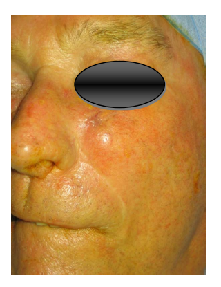
Figure 1. Indurated nodular oval jugular tumefaction.

An indication for surgery was given after PCR, and we excised the lesion under GA with a lateral margin of 15 - 20 mm, followed by simultaneous reconstruction of the different anatomical subunits using a frontal flap plus a