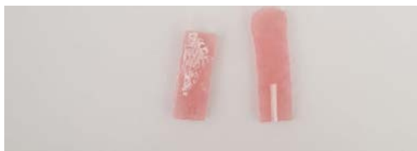
Figure 4. Fracture at the side of reinforcement.