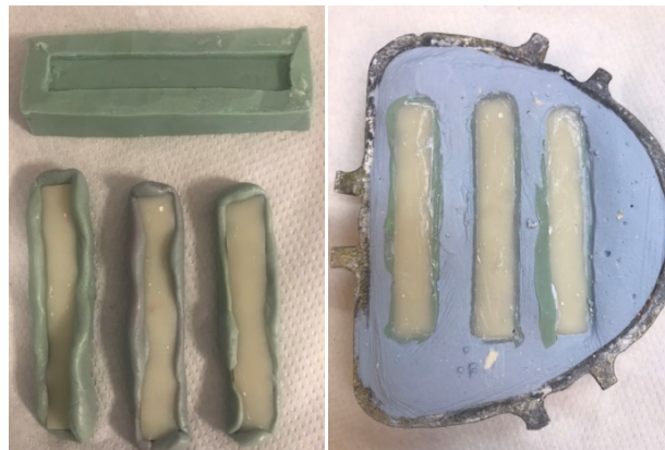
Figure 2. Silicone base specimens with petroleum jelly in the flask.