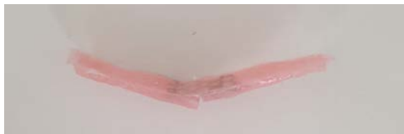
Figure 3. Bending of the sample.

The current study evaluated the effect of the transverse strength of different reinforcement material embedded in autopolymerizing acrylic resin. Group A was the lowest among all groups which is generally proportionate with the results reported in former studies that used autopolymerizing acrylic resin for repairing specimens of heat-polymerizing resin [6] [19] [20]. In a reported reinforcement study with an autopolymerizing adhesive resin and 4 mm-long reinforcement material, the transverse strength was nearly 134% higher than that of intact heat-polymerizing acrylic resin specimens. In this study, all groups that were repaired with the use of reinforcement materials fractured at the side of the