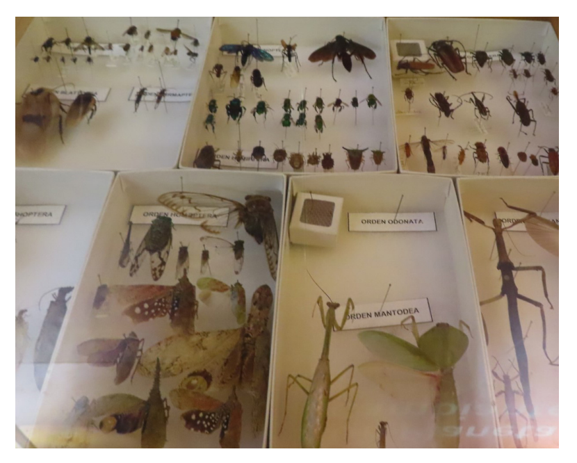
Figure 31. Fauna (insects) on display at Punta Culebra Nature Center (Smithsonian) on Amador Causeway in the Pacific Ocean.

Lake Gatun via surface runoff either in solution or attached to the sediment. These pesticides included 2,4,5-T containing TCDD, can bio-accumulate in fish and birds and enter into the food supply and were eaten by humans. The extent of the current pesticide, herbicide and chemical contamination on former U.S. military base grounds in Panama Canal Zone, in Lake Gatun and the Panama Canal channel is unknown. Systematic sampling of the Lake Gatun and the Pa-