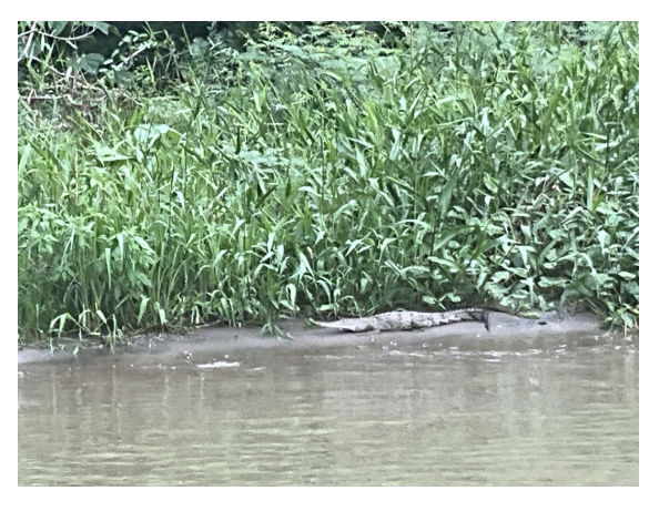
Figure 20. American crocodile on shore of Lake Gatun.