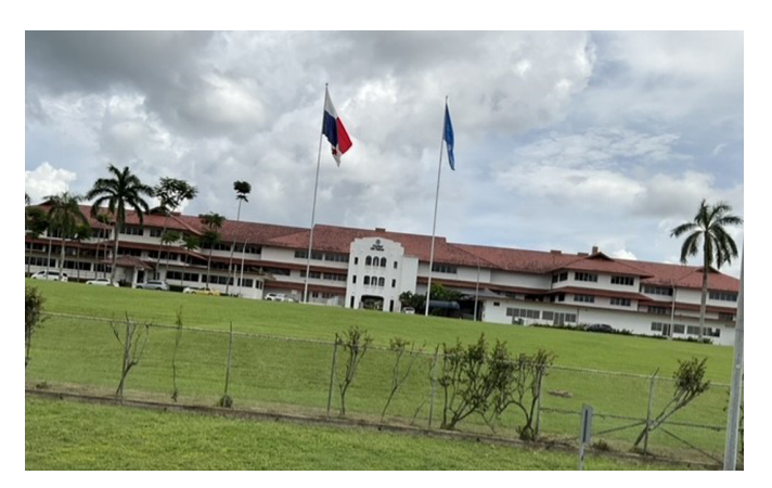
Figure 30. Former Fort Clayton.

with the contaminant dioxin TCDD was sprayed on Panama Canal Zone highways, structures, military grounds (Figure 30) and perimeter fences using sprayers mounted on trucks in the Panama Canal Zone. These trucks were washed out at the motor pool each day and the runoff flowed into the Panama Canal and Lake Gatun" [15] [16].