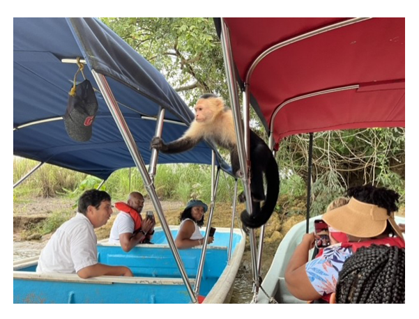
Figure 24. Monkey on island in Lake Gatun. The monkey boarded the tourist boats to eat peanuts and bananas.