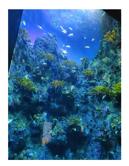
Figure 22. Fish in tank at the Punta Culebra Nature Center (Smithsonian) on Amador Causeway in the Pacific Ocean.