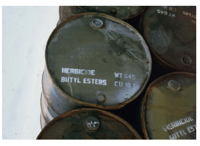
Figure 29. Barrels containing 2.4.5-T on a ship passing through the Panama Canal.

tary base grounds (from 1948 to 1999) (Figure 30). There are commercial ship transport records, which show commercial herbicide 2,4,5-T containing the contaminant TCDD was used on military bases in the Panama Canal Zone [15] [16] the commercial herbicides including 2,4,5-T by-product containing unknown levels of TCDD were used from 1948 to at least 1985 and probably 1999 on the military base grounds and perimeter fences by military base personnel including civilians to control the vegetation and insect pests and would have added TCDD to the Panama Canal Zone environment. There is evidence that 2,4,5-T