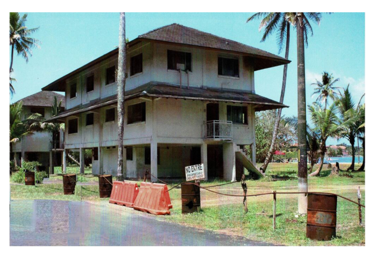
Figure 11. Rusted Agent Orange barrels which contained 2,4,5-T more than 50 years ago. Was part of a 2020 barrier protecting the Fort Sherman parking lot.

during monsoon rains. Dioxin TCDD was attached to sediment and transported by overland flow ( Figure 12 ) into the waterways ( Figure 13 ) and Lake Gatun ( Figure 14 ).