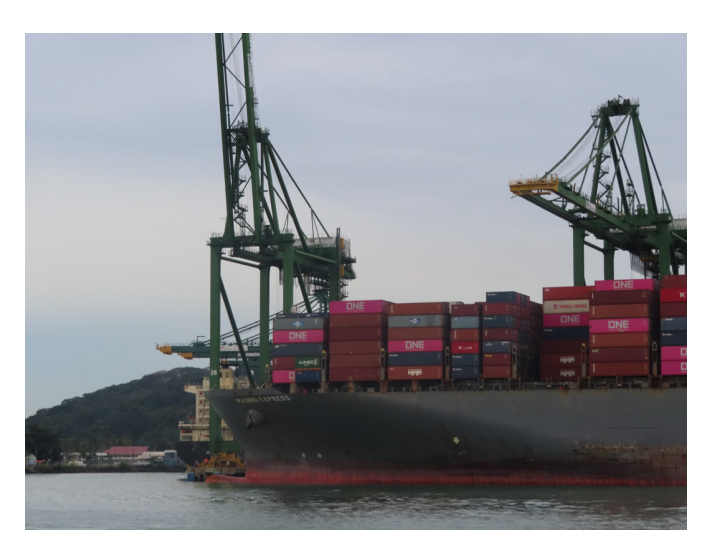
Figure 26. Cranes unloading container cargo at a Port on the Panama Canal.