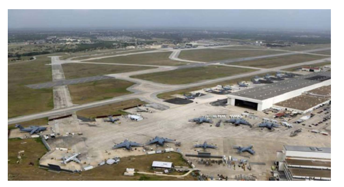
Figure 28. Kelly Air Force Base in Texas. This was the command headquarters for shipping tactical herbicides through the Panama Canal Zone. Agent Orange and Agent Blue were stored at the Base. Credit Line: Photograph courtesy of Kelly Heritage and the Houston Chronicle. Published with the copyright permission from Editor of the Open Journal of Soil Science.