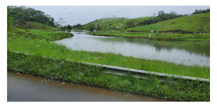
Figure 13. Overland flow into Lake Gatun waterways.