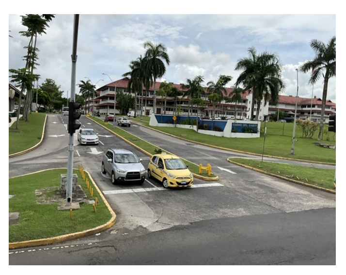
Figure 15. Former Fort Clayton buildings, fence and grounds.

binds to a carbon (C) molecule. The most toxic of all the dioxins and dioxin-like compounds is TCDD [4]. Sediment and soil sampling of the military base grounds (Figure 15), Lake Gatun (Figure 16) and Panama Canal (Figure 17) and (Figure 18) could demonstrate that only commercial herbicides were used in the Panama Canal Zone. Commercial spraying could have resulted in TCDD remaining in the soils. TCDD is not water soluble; however, it can adhere to fine soil particles, organic materials, leaf surfaces, and sediments that can be carried by runoff into downstream waters (Figure 13) and deposited in wetlands, lakes and ponds [4]. TCDD can then bio-accumulate in aquatic species (Figure 19) and (Figure 20) and can become biomagnified throughout the food chain via aquatic and terrestrial vegetation, fowl (Figure 21), fish (Figure 24) [4].