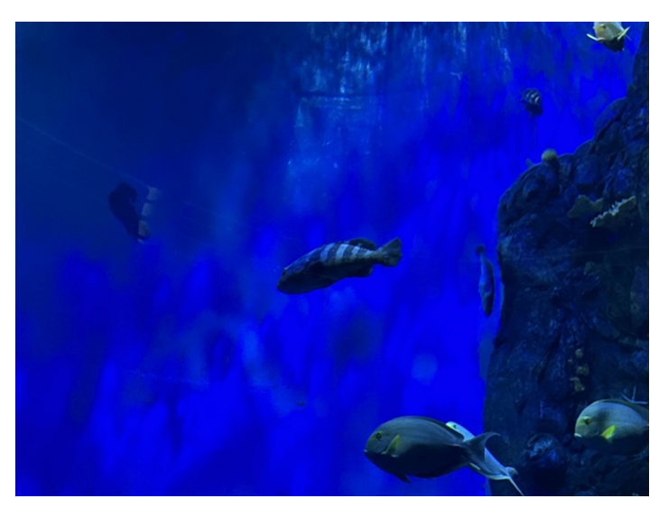
Figure 19. Fish tank at the Biomuseo (Smithsonian) on Amador Causeway.