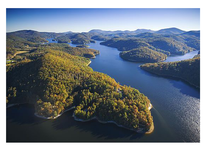
Figure 16. Lake Gatun forested. Forested islands and peninsula uplands in Lake Gatun.