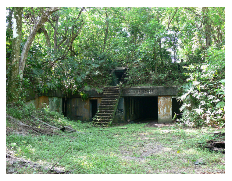
Figure 9. A former battery at Fort Sherman. The jungle vegetation is reclaiming the site.

While serving in Panama Canal Zone including Fort Sherman (Figure 9), the US Jungle School (Figure 10), many Vietnam Era veterans came in contact with 2,4,5-T with unknown amounts of dioxin TCDD that was sprayed on military bases [6]. The military personnel, serving in the Panama Canal Zone, were told that the herbicides, including 2,4,5-T with unknown amounts of dioxin TCDD, were harmless. The herbicide handlers, including both Panamanian civilians and United States soldiers, were apparently told they did not need protective gear (since it was a harmless agricultural herbicide widely used by American farmers), such as facemasks googles, gloves and suits (personal communications with Panama Vietnam Era Veterans who claim to have been exposed to dioxin TCDD and who have filed for VA benefits but were denied). The herbicide 2,4,5-T often came in contact with the skin of the military personnel and civilian ground crews who were spraying dioxin TCDD. The empty herbicide barrels (Figure 11) containing 2,4,5-T with unknown amounts of dioxin TCDD were washed often without protective gear and poured out on the ground by hand. After cleaning the barrels, the rinse water was poured on the soil surface. Dioxin TCDD was either leached into the soil and groundwater or transported off-site