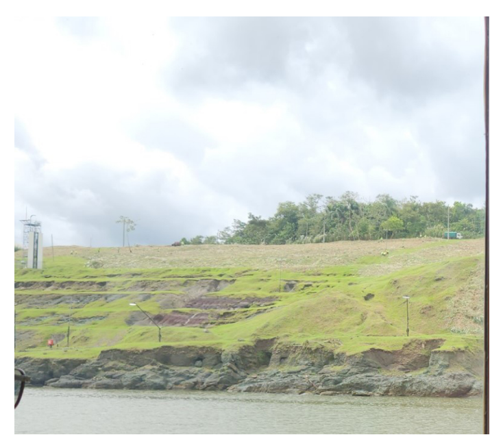
Figure 12. Gully erosion of a Lake Gatun tributary stream channel.