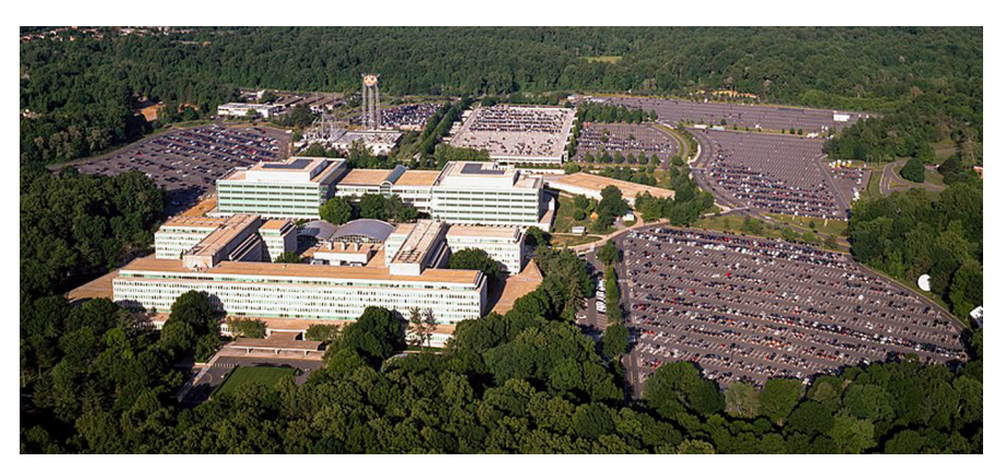
Figure 2. Fort Detrick biological weapons laboratory headquarters in Maryland: Photo credit: Photograph courtesy of Andrew Dutton.

These dual-purpose herbicides, 2,4,5-T and 2,4-D were used by CIA, DOD, and USDA. New Zealand, American, European, Canadian and Australian farmers in the late 1940s started using 2,4,5-T herbicide to eliminate weeds from cropland including cotton and pastureland. Synthetic herbicides (and pesticides) development continued, after WWII, in addition to breeding of high-yield plant varieties and production of synthetic fertilizers. As part of the Green Revolution these new agricultural products were then shipped worldwide to increase crop yields. This new system of agricultural technologies engineered by plant breeders and agriculture chemists was intended to increase food production by increasing field and farm crop yields in the major production regions. The result today is agriculture's ability to reduce global starvation, improve nutrition and help solve the problem of local and world food insecurity. In contrast, the goal of military use of herbicides, as military and environmental chemical weapons, was to destroy food crops and defoliate jungle forests as a tactic with other weapon systems to win battles and wars [1].