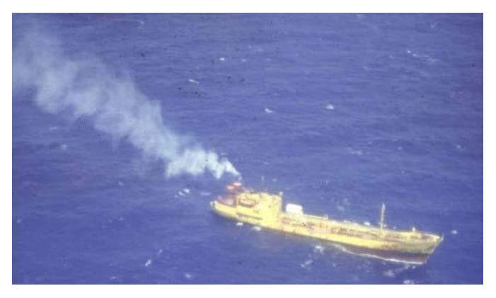
Figure 25. Incineration of Agent Orange (2,4,5-T with unknown amounts of dioxin TCDD).

A GAO review of DOD and Veterans Administration (VA) documents [12] " identified multiple examples of incomplete and inaccurate information on the DOD's list of tactical herbicides storage and test sites such as Kelly Air Force