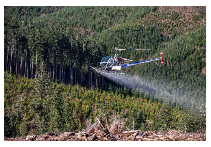
Figure 5. Spraying of 2,4-D by contractors for the USDA, Forest Service in Oregon.