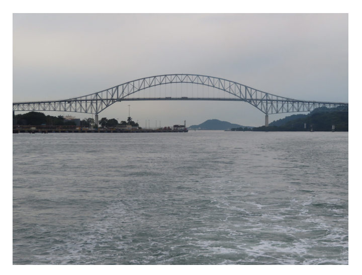
Figure 27. The Pan-American bridge over the Panama Canal.

According to an Air Force Logistics Command's Office of History monograph [12], "the command directly responsible for managing 2,4,5-T herbicide was the Directorate of Aerospace Fuels at the San Antonio Air Material Area located at Kelly Air Force base. During the Vietnam War Kelly Air Force Base was also a subcomponent of the U.S. Air Force Logistics Command". GAO documentation [12] shows "that quantities of 2,4,5-T were stored at Kelly Air Force Base in Texas in 1972. There were 38,940 gallons of 2,4,5-T containing TCDD stored in