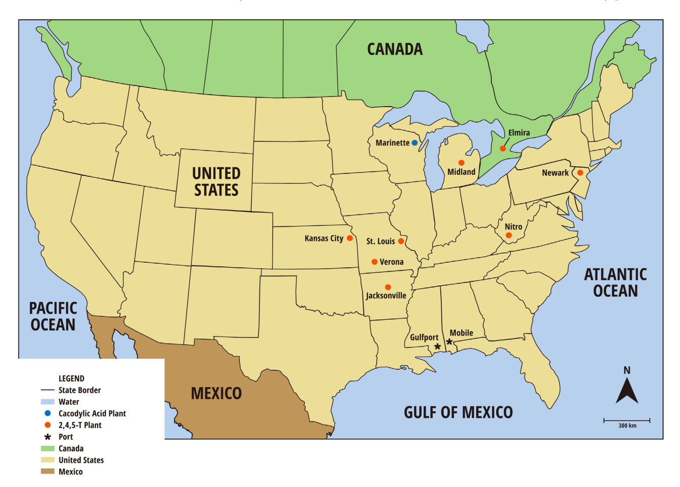
Figure 4. The North American locations of the eight 2,4,5-T (Agent Orange) chemical manufacturing plants, the primary Agent Blue chemical manufacturing site and the two Ports on the Gulf of Mexico where tactical herbicides were loaded on ocean-going ships. Map created by Cruz Dragosavac (reprinted with permission from editor of Open Journal of Soil Science).

A less frequently told story was the human health and environmental impacts on the chemical plant workers who manufactured 2,4,5-T contaminated with dioxin TCDD during the manufacturing processes. The communities affected include one site in Canada and seven locations in the United States ( Figure 4 ) [9]. The pollution at these chemical plant sites, groundwater and adjacent rivers is well known within each affected province or state but not widely recognized beyond their communities. Olson and Speidel [9] assessed: " The national long-term ef fects on land, groundwater and river resources where 2,4,5- T herbicide with unknown amounts of dioxin TCDD were manufactured, transported, and tempo rarily stored. The sites where 2,4,5- T herbicide with contaminated by-products