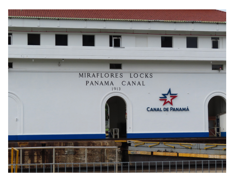
Figure 17. Miraflores locks sign on Panama Canal building.