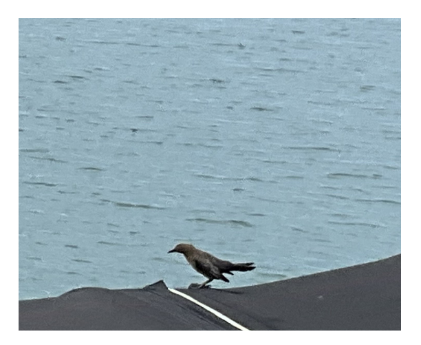
Figure 21. Bird at the boat dock on man made peninsula.