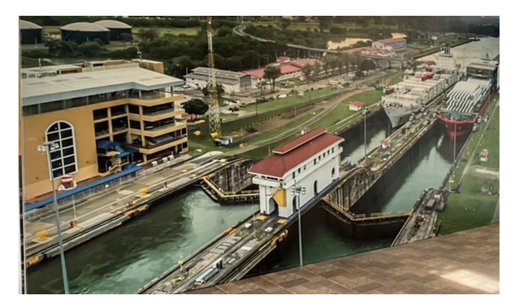
Figure 18. Panama Canal Miraflores locks. Two ships passing through the classic locks at the same time.