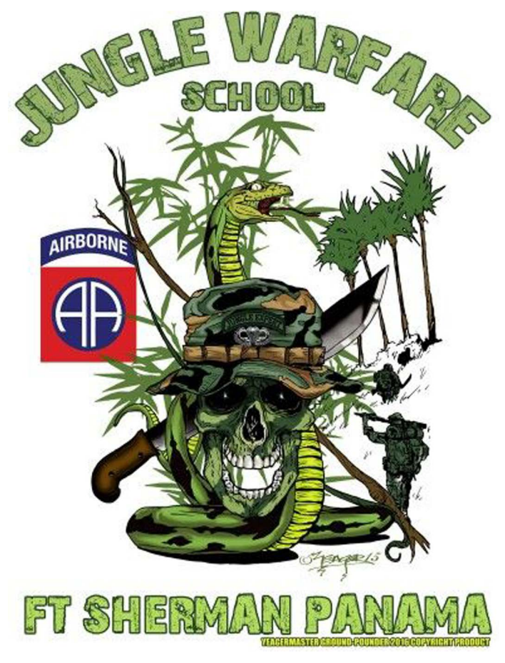
Figure 10. Symbol of the Jungle School at Fort Sherman.