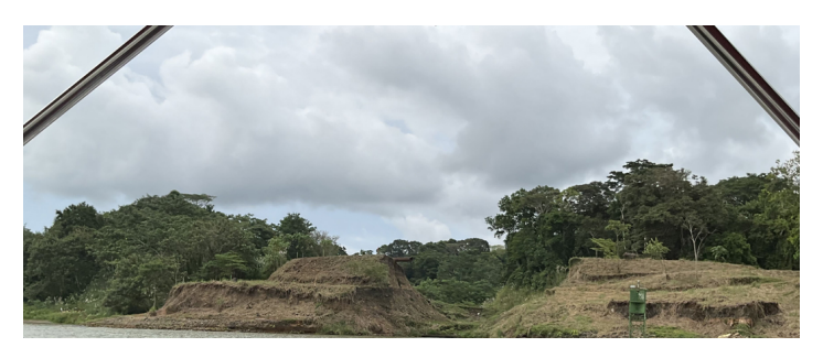
Figure 14. Lake Gatun shoreline stream bank erosion.

Unfortunately, 2,4,5-T herbicide formulations had a contaminant 2,3,7,8-Tetrachlorodibenzodioxin (TCDD), which under anerobic conditions did not easily degrade and had a very long half-life. The term "dioxin" includes about 300 chemicals which are formed when chlorine, at very high temperatures,