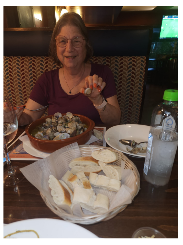
Figure 23. Tourist eating clams at a restaurant on the Panama Canal.