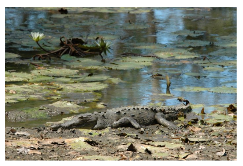
Figure 11. American crocodile in Lake Gatun. Reprinted with permission from Editor of Open Journal of Soil Science.

associated with complex sulfurous minerals made up of sulfur, gold, iron, copper, silver, nickel, antimony and cobalt due to the anionic ion structure being similar to sulfate ( 2 \text{ SO}_4^- ). Arsenic is a chemical element which occurs in many minerals. Arsenic and its compounds including the trioxide are used in insecticides and pesticides. Arsenical herbicide use is declining due to the toxicity of arsenic and its compounds. Arsenic is the 53rd most common element in nature comprises about 0.00015% of the Earth's crust. Typical background concentrations of arsenic are about 100 mg/kg in the soils, usually less than 10 ug/L in freshwater and 3 ng/m<sup>3</sup> in the atmosphere" [13].