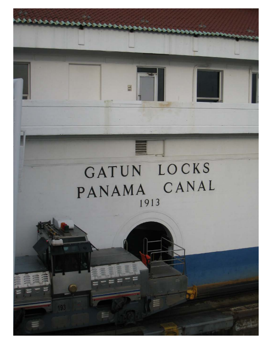
Figure 3. Gatun Locks sign dated 1913 at the Panama Canal dam. Reprinted with permission from Editor of Open Journal of Soil Science.