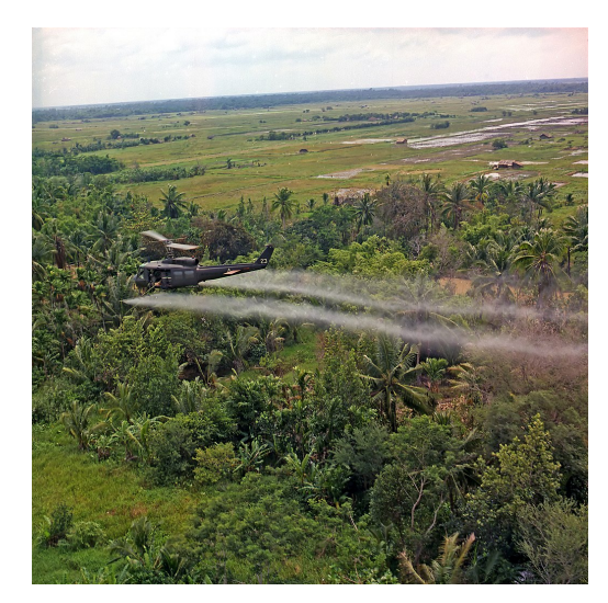
Figure 8. Cacodylic acid being sprayed by arial sprayers.