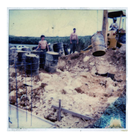
Figure 10. Tactical herbicides barrels being buried by military personnel. Reprinted with permission from Editor of Open Journal of Soil Science.

Figure 9. Ships going through a lock near the southern entrance of the Panama Canal. Reprinted with permission from Editor of Open Journal of Soil Science.