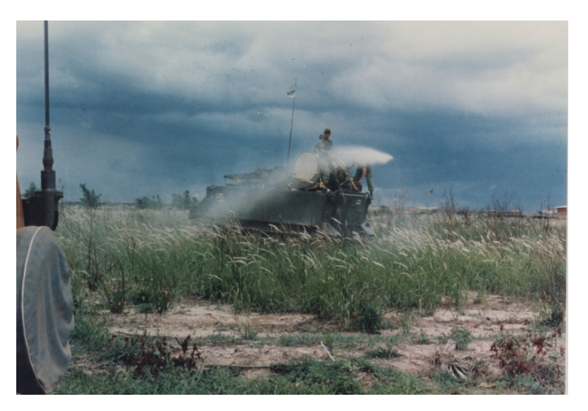
Figure 7. Tactical herbicides sprayed from a vehicle.

Cacodylic acid has been widely used in developed countries in forestry and agriculture for many years prior to the Vietnam War with few known risks to human health [25] [26]. In 1960s and 1970s the US military tested tactical herbicides in Panama Canal Zone [22] [24]. The most likely herbicides tested were probably cacodylic acid, 2.4-D and 2,4,5-T with unknown amounts of dioxin TCDD) [24]. Cristobal and Balboa ports were the port destinations in the Panama Canal Zone which received herbicide shipments for testing and use on military base grounds. Fort Detrick scientists, DOD, CIA, and USDA may have secretly tested cacodylic