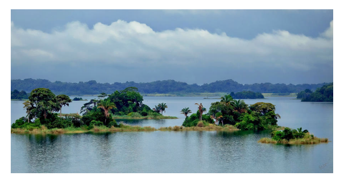
Figure 4. Islands in Lake Gatun which were created in 1913 as a result of Gatun dam. Reprinted with permission from Editor of Open Journal of Soil Science.