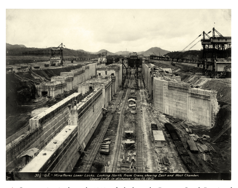
Figure 1. Construction in the early 1910s of a lock on the Panama Canal.

Commercially available white arsenic was purchased to eliminate the floating plants. White arsenic was mixed with soda bicarbonate and water [10] [11] and applied to the floating plants. In 1914, white arsenic was commercially from multiple sources including the Panama Canal Zone Company or the Naval Depot Supply Federal and Stock Catalog. The Federal Standard Stock Catalog (Procurement Division of the Treasury) was not established until 1935. This arsenic and soda was then sprayed on floating plants including hyacinths. An outfit consisting of a 10 m steam launch with a quarter boat and a pump boat was used [10] [11]. The launch supplied steam to the pump boat and for transportation of men and towing of supplies. The arsenic mixture used was made up of