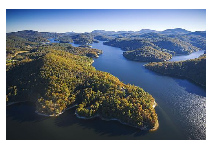
Figure 5. Forested islands and peninsula uplands in Lake Gatun. Reprinted with permission from Editor of Open Journal of Soil Science.

Figure 4. Islands in Lake Gatun which were created in 1913 as a result of Gatun dam. Reprinted with permission from Editor of Open Journal of Soil Science.