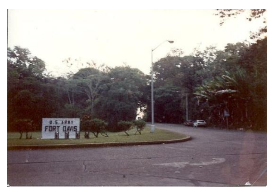
Figure 25. U.S. Army Fort Davis sign. The base was located on the Atlantic side of the Panama Canal Zone.

The U.S. Army technical manual [9] and the U.S. Army Medical Department Center and School subcourse [10] for groundskeepers were used to provide guidance on how to eradicate specific weeds, such as kudzu, and insects on the military base grounds (Figures 25-30). The military properties, housing units, and connecting roads were sprayed daily using truck-mounted sprayers apparently filled with DDT. In the 1940s and 1950s termite stake studies [7], with