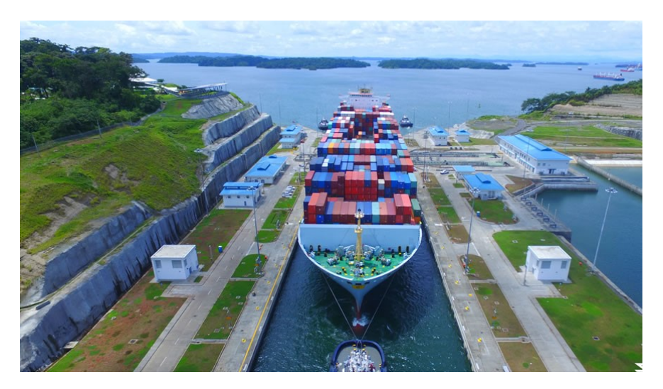
Figure 7. Loaded ship coming through a lock on the southern entrance to the Panama Canal.