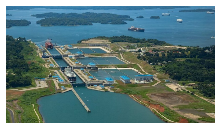
Figure 4. Locks at the southern (Pacific Ocean) entrance of Panama Canal Zone.