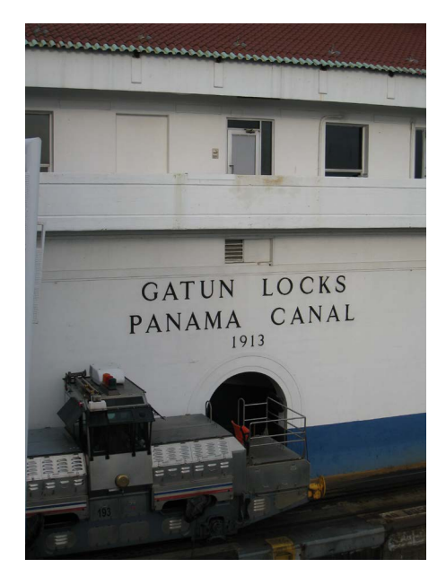
Figure 3. Gatun Locks sign dated 1913 at the Panama Canal.