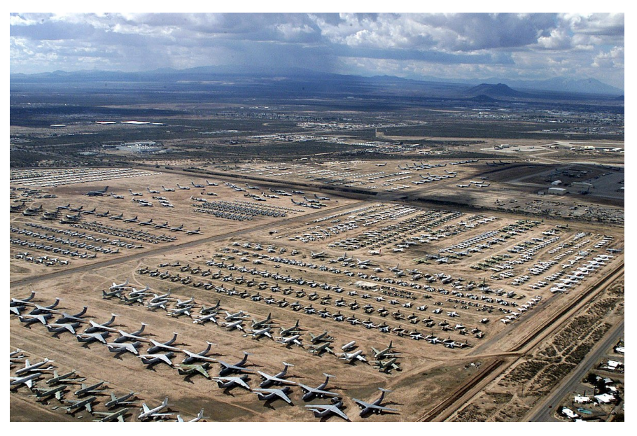
Figure 34. Perimeter fence at Davis-Monthan Air Force base in Arizona where the U.S. military planes go to die.