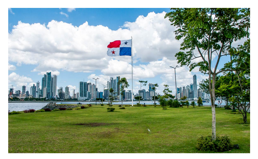
Figure 16. Panamanian flag and parkland across the canal from Panama City which is in background.