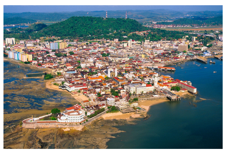
Figure 15. Panama City at the mouth of Panama Canal at Pacific Ocean.