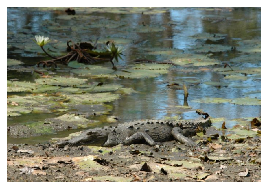
Figure 21. American crocodile in Lake Gatun.

When the Spaniards came in the 16<sup>th</sup> century the land was occupied by Kuna, Choco, and Guaymi Native American groups. The population soon included mestizos, a mix of people with Indian and Spanish ancestry. With the construction of the Colon-Panama City railroad, new ethnic groups from all over the world arrived to work on the railroad as laborers. The Native Indians often lived in rainforests. Most of the Indians, including the Choco, engaged in subsistence agriculture, hunting and fishing, while the Kuna were sailors, traders and mechanics and the Guaymi worked on banana plantations in western Panama. Today the Mestizos, who are intermarried with people of West India and African ancestry are the largest Native American group in Panama. They predominately live west of the canal in the savannas and in the central provinces of Colon and Panama.