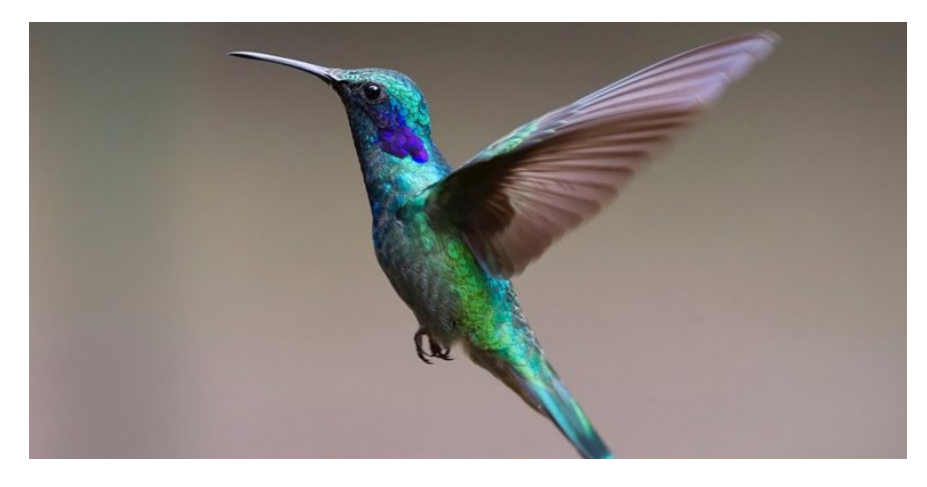
Figure 2. Humming bird in flight in the Panama Canal Zone.

Figure 1. Panama Canal Zone map showing the Panama Canal, Lake Gatun, military bases and Panama City.