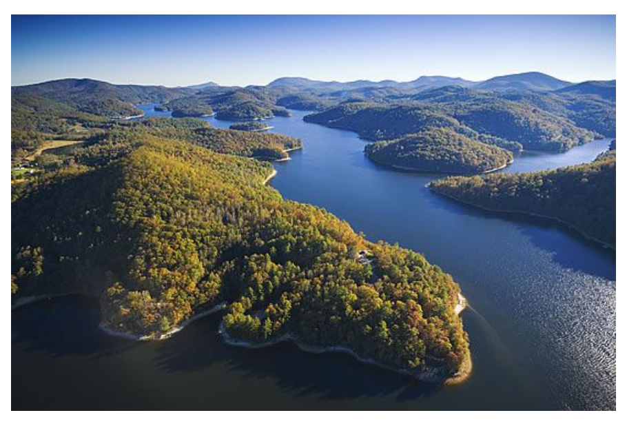
Figure 19. Forested islands and peninsula uplands in Lake Gatun.