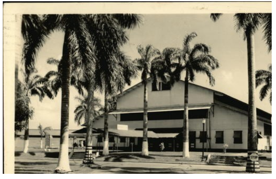
Figure 27. Service center at Fort Davis near Colon, Panama.