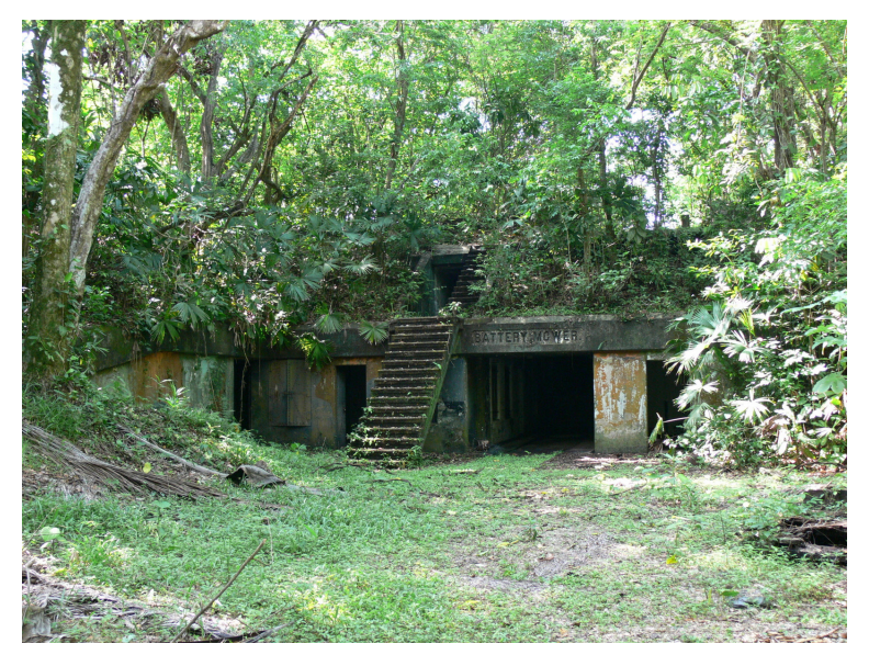
Figure 29. A former battery at Fort Sherman. The jungle is reclaiming the site.

Figure 28. Fort Sherman sign and location of the United States military's Jungle School for many decades.