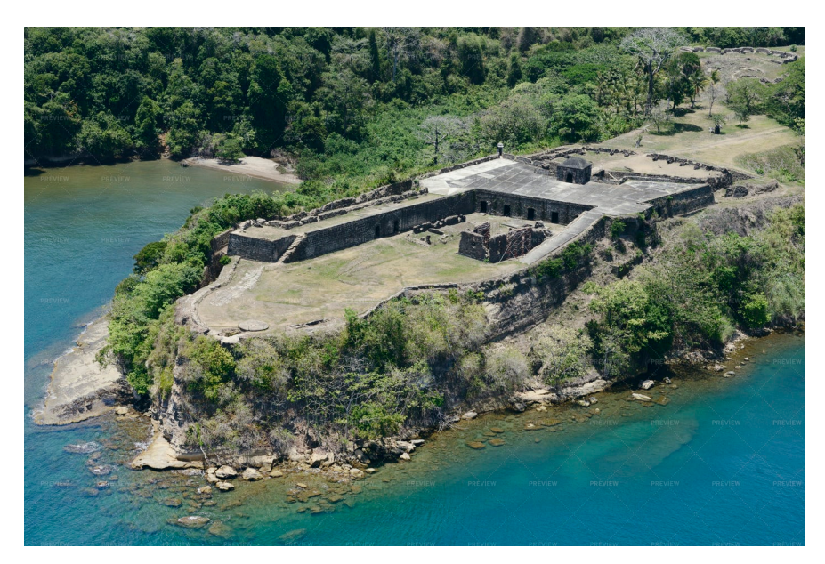
Figure 30. Peninsula with a former military structure on Fort Sherman.

stakes dipped in pesticides and other chemicals including lead arsenate, sodium arsenite and DDT were conducted by the USDA, Forest Service on Barro Colorado Island where the Smithsonian headquarter buildings are located [7]. In 1963 the Curundu Jungle Test site at Fort Clayton on the Pacific side was used to determine which pesticide and chemically treated stakes would not be eaten by the termites. The commercially available herbicide, 2,4-D was used in Lake Gatun since 1948, which was the feeder lake water source for the Panama Canal.