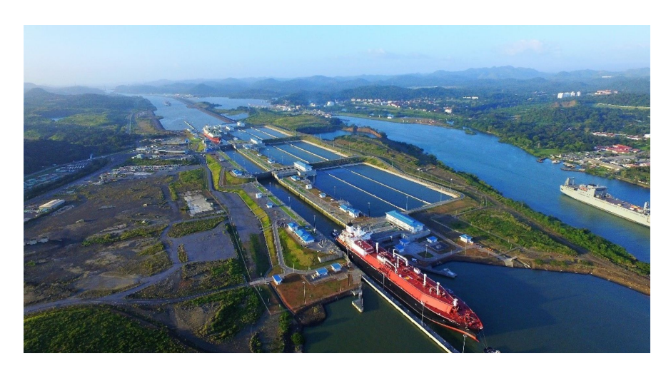
Figure 8. Ships going through a lock near the southern entrance of the Panama Canal.