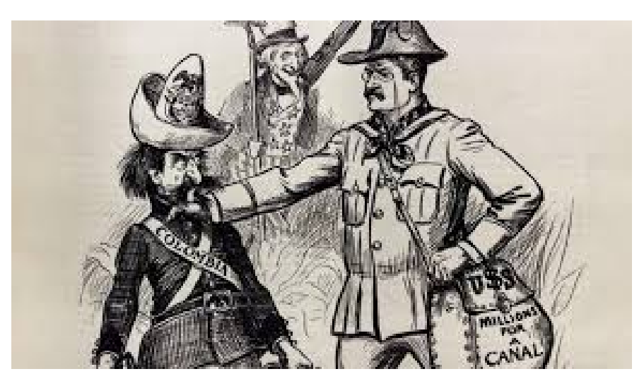
Figure 12. President Roosevelt enforcing his will on the leader of Colombia. The agreement was actually with Colombia and not Panama.