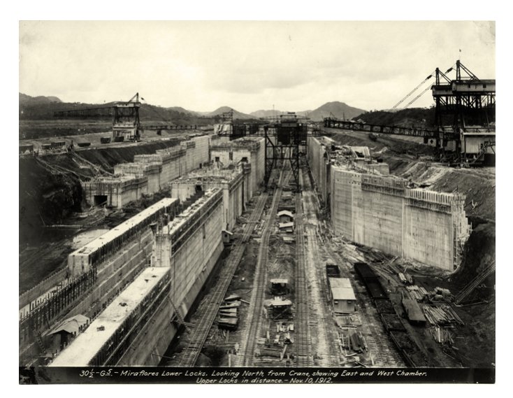
Figure 10. Construction in the early 1910s of a lock on the Panama Canal.