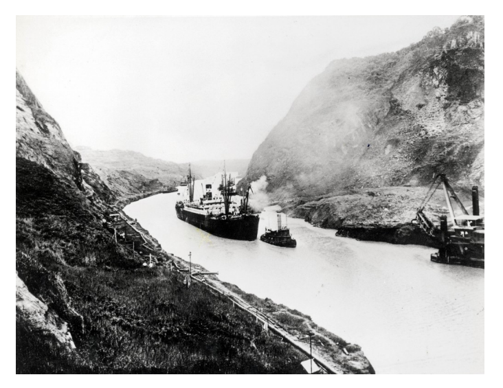
Figure 11. Tug boat pulling a ship through the Panama Canal in the 1910s.