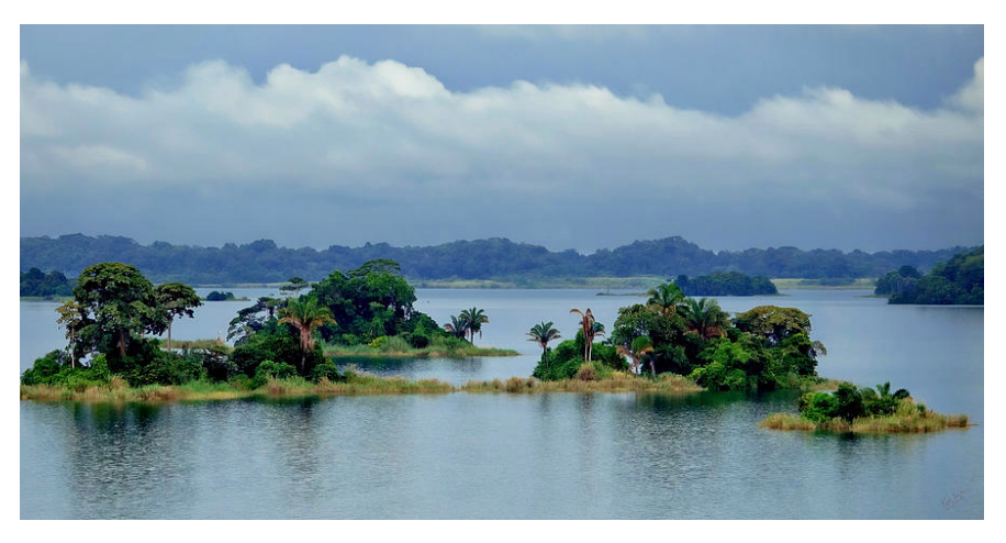
Figure 20. Islands in Lake Gatun which were created in 1913 as a result of the Gatun dam.

The climatic conditions on the Pacific side of Panama differ from the Atlantic region. On the Atlantic side, the Tabasara Mountains face the rain-bearing trade winds and receive twice the average rainfall as the Pacific side. The Caribbean coast receives 150 to 350 cm per year and the Pacific coast receives 110 to 230 cm. It rains throughout the year on the Caribbean side while the Pacific region has a rainy season from May to December and a dry season from January to April. As a result of rainfall distribution patterns, the Caribbean slopes have a tropical rainforest and savannas (tropical grasslands) are common between the Caribbean shoreline line and the Tabasara Mountains. The mean temperature of the coldest months seldom drops below 26 degrees C on either coast due to Panama's tropical location. The Panama mountains create three climate zones [3]. A low, hot zone area has elevations below 700 m which includes 90% of the country; a temperate zone with elevations between 700 and 1500 m; and a tiny