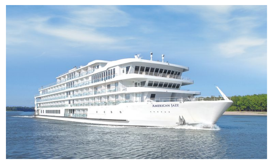
Figure 22. Cruise ship going through the Panama Canal.

The service sector generates 75% of Panama's gross domestic product (GDP). Services are related to canal traffic (Figure 22), public administration, mineral extraction (Figure 23) offshore banking and other services. Fishing and agriculture accounted for less than 10% of the GDP prior to 1990s [1]. Prior to the 1990s, U.S. military forces stationed in Panama supported 5% of GDP. After U.S. troop withdrawal, the Panamanian government lost millions of dollars. The Panamanian government has re-developed (Figure 24) the previously U.S. controlled properties in the Panama Canal Zone and prime real estate in Panama City. The government repaired the road and rail system and has promoted ecotourism. China, Latin America, Middle East and the U.S. have all invested in