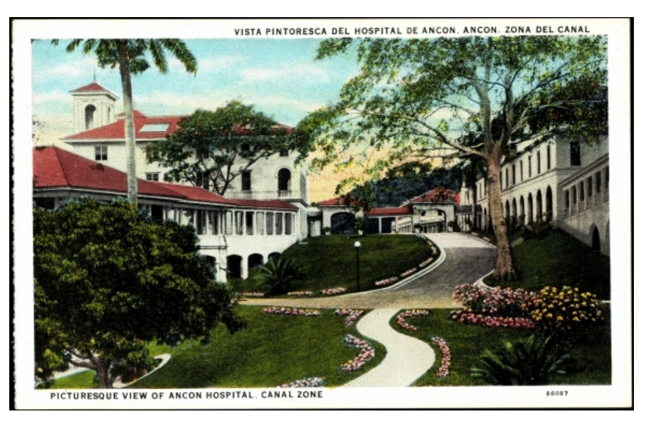
Figure 32. The Ancon hospital located in the Panama Canal Zone where the malaria and yellow fever.

the U.S. Army Medical Officer to control of yellow fever which consisted of extensive drainage to reduce breeding of mosquitoes and putting screens on houses. The Isthmus of Panama was an ideal environment for mosquitoes [11] [12]. The same concept was applied a few years later in Panama [8]. In June 30, 1904 the Sanitary Department was created and headed by Colonel Gorgas. He applied a military style campaign to eradicate mosquitoes, which, while costly, greatly reduced the breeding of mosquitoes and yellow fever and malaria transmission [8].