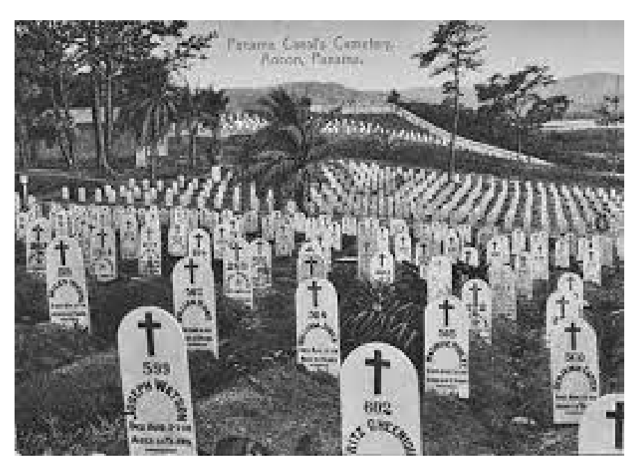
Figure 31. A cemetery used to bury the dead who died of malaria and yellow fever during the 1910s.