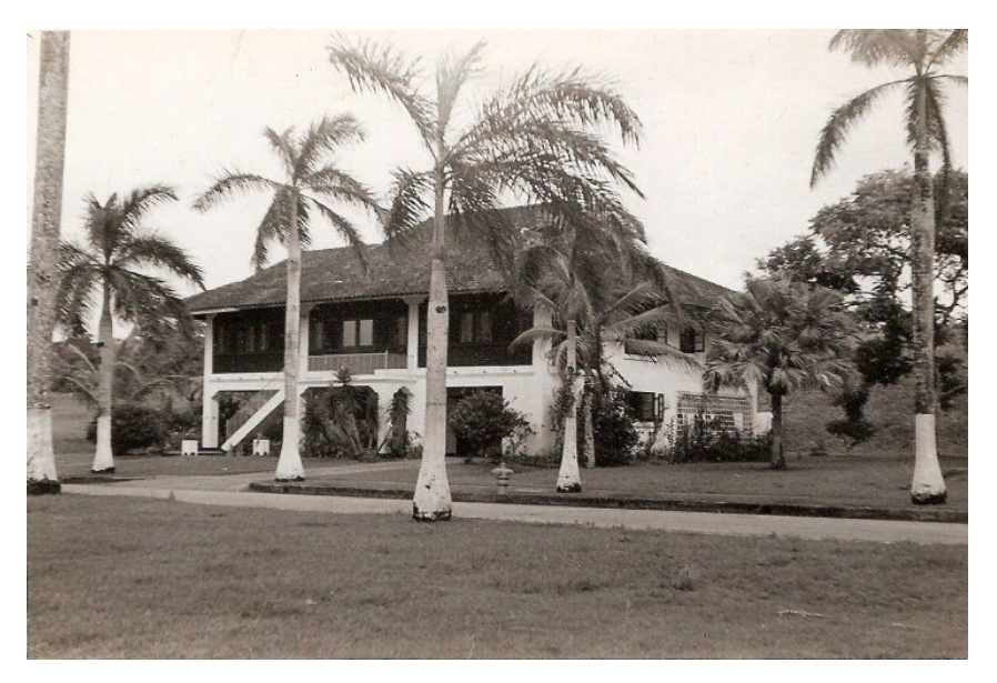
Figure 26. Housing at Fort Davis near Colon, Panama. The residences and fort were sprayed nightly to control the insects. DDT was the most commonly used pesticide.