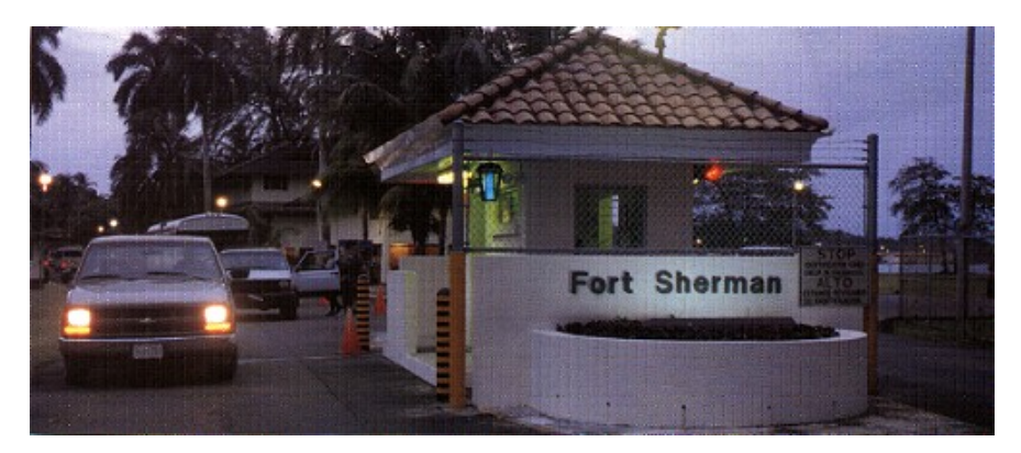
Figure 28. Fort Sherman sign and location of the United States military's Jungle School for many decades.