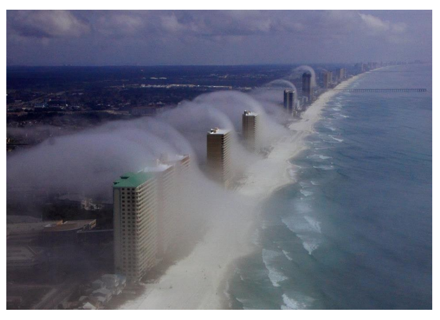
Figure 18. Mist created by temperature difference between the upland and the Pacific Ocean near Panama City.

includes the Cordillera de San Blas Range in the east and the Tabasara Mountain Range in the west [3]. These ranges are separated in the center of Panama by a saddle of lower elevation land. The country's highest peak is Baru, an inactive volcano which has an elevation of 3475 m. The Pacific coast has numerous headlands and bays in the Gulf of Panama. The large Chiriqui Lagoon is where Columbus made his last attempt to find a passage to the East Indies. The continental shelf is much more extensive on the Atlantic side. Most of the 1600 islands are on the Pacific coast side.