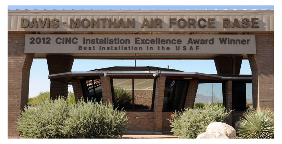
Figure 33. Davis-Monthan Air Force Base Headquarters in Arizona. The final resting place for U.S. military planes.

Was Agent Blue destroyed in Kelly Air Force base burn pits? If so the smoke coming from the burn pits would have become an environmental problem since the particulate and ash would have contained toxic As contaminants and aerosols. The military base personnel could have been exposed to and inhaled arsenic laden smoke. Was it buried in the soil at Kelly Air Force base? If so, the water soluble As would eventually leak from the barrels in the last 50 years and into the groundwater. If so, the military base personnel could have been exposed to arsenic and some Kelly Air Force Base Vietnam Era Veterans [12] have already filed VA claims for benefits as a result of exposure to either TCDD or arsenic. The fourth option would have been to transport the Agent Blue to Davis-Monthan Air Force Base in Tucson, Arizona for weed control around the aircraft and perimeter fence ( Figure 33 and Figure 34 ). This would have been in