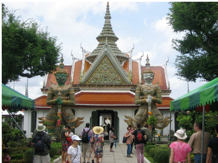
Figure 15. Guarded temple with tourists.