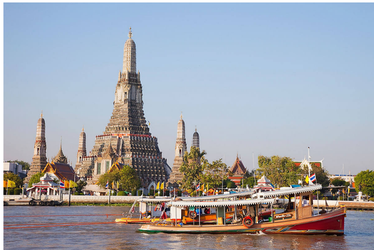
Figure 1. Floodwall protecting the Bangkok temples. In the foreground are tourist tour boats.

The capital of Thailand, Bangkok is the home of 15 million people and is situated on the Chao Phraya River and Delta. The city is located 28 km north of the Gulf of Thailand. It is known as “The Venice of the East” with dozens of large canals (Klongs) which drain into the Chao Phraya River [1]. The water table is at or near the surface throughout the Bangkok area (Chao Phraya Delta). During the monsoon season many areas in Bangkok flood. The city has been subsiding at the rate as high as 10 to 12 cm per year and some areas have already subsided 150 cm or more. Parts of the city are now below sea level and require floodwalls (Figure 1) or to be on stilts (Figure 2) especially in the south-eastern metropolitan area where the floodwaters reside there for a much longer time period and drainage has become less efficient as a result of reduced gradients in storm drains and canals. Bangkok is on a nearly level marine-deltaic plain only 0.5 to 1.5 m above mean sea level. The past 50 years the groundwater pumping in Bangkok metropolitan had resulted in a reduction in pore pressure, compression of surficial deposits and silt, dramatic lowering of piezometric levels, and total ground subsidence of more than 0.5 m. Artificial recharge is needed to restore piezometric heads of the multi-aquifer system.