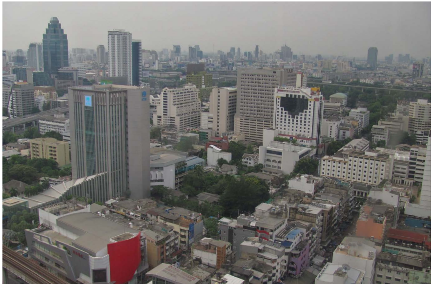
Figure 3. A view with many skyscrapers of Bangkok.