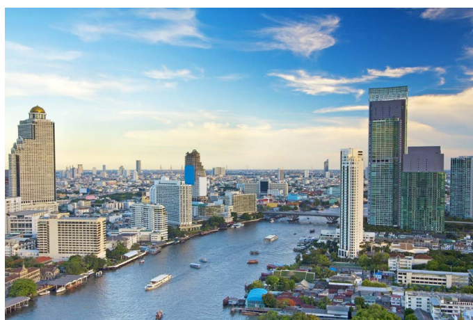
Figure 22. Bangkok and the Chao Phraya River with skyscrapers on both sides of river.