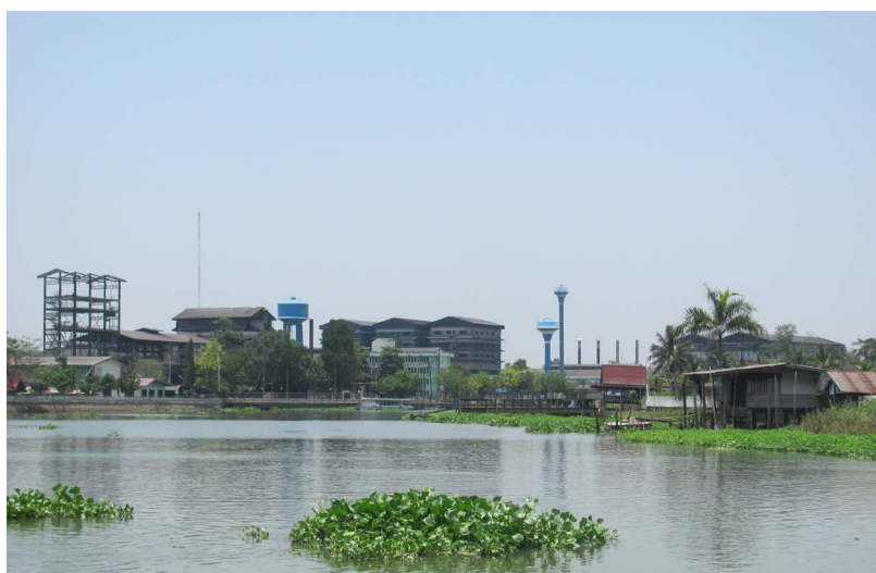
Figure 30. Industry along the Chao Phraya River.