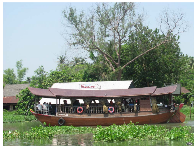
Figure 7. Transportation of tourists by boat on the Chao Phraya River.