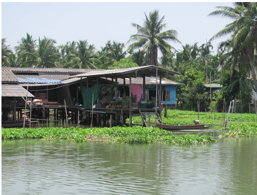
Figure 5. House on stilts during a flooding event along the Chao Phraya River in Bangkok.

In 2011, the monsoon season brought the worst flooding in decades, a fifth of the city was underwater ( Figure 5 ). The business district was spared thanks to hastily constructed levees and dikes. The rest of the Thailand was not so lucky, approximately 500 people lost their life by the end of the 2011 monsoon season. Sections of Bangkok are already partially below sea level.