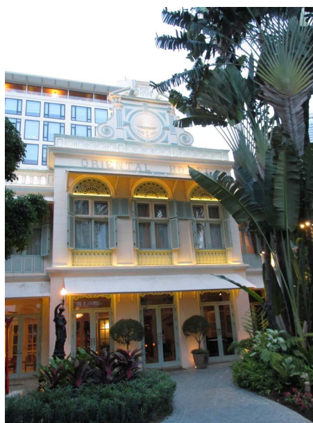
Figure 23. Oriental Hotel which attracts international tourists.