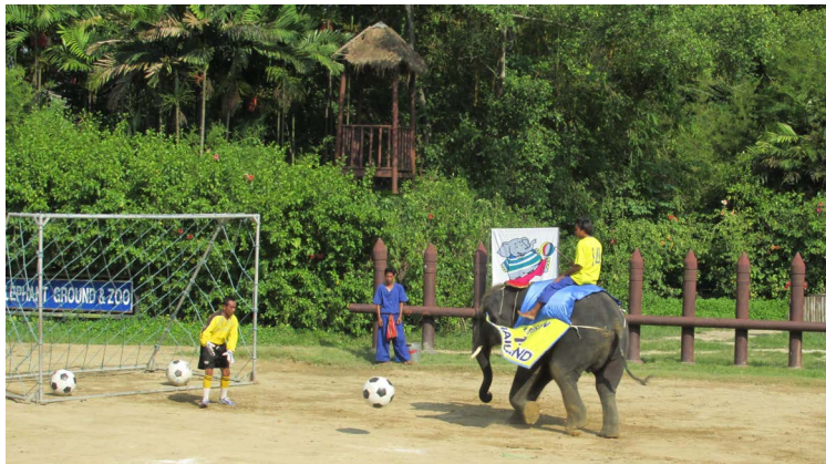
Figure 14. Elephant playing soccer.