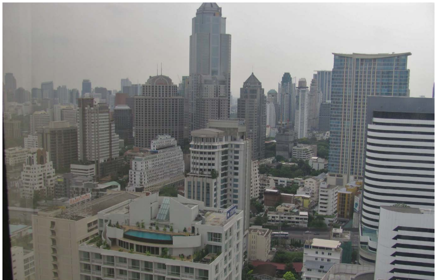
Figure 4. The heavy skyscrapers of Bangkok.

to the cities slow descent into the water, Bangkok has become a victim of its own successful urban development. Bangkok was built on the Chao Phraya Delta a once marshy land about 1.5 m above the sea level. The tarmac at the Don Muang airport was flooded in 2011. As temperatures increased, abnormal weather patterns with more erratic rainfall, more cyclones and increased floods ( Figure 5 ) and droughts are predicted over time adding pressure on the Thailand government to address the potential climate change with greater frequency of extremes. Bangkok is projected to be one of the world's hardest hit urban areas along with Jakarta, Ho Chi Minh City and Manila. Bangkok is sinking one to two cm a year with the risk of massive flooding in the next few years. The Gulf of Thailand is rising by 4 mm/yr which is above the global sea rise average.