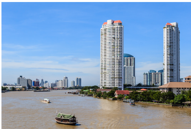
Figure 21. Large skyscrapers along the muddy Chao Phraya River.