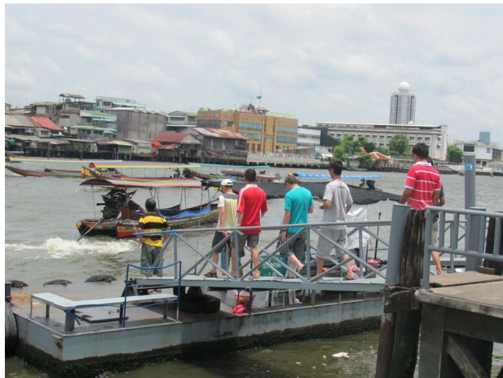
Figure 27. Tourist boats on the Chao Phraya River.

The lowland areas of the Chao Phraya basin in central Thailand are freshwater swamp forest, a subtropical and tropical moist broadleaf forest. The area is 400 km north to south and 180 km wide and is in the Chao Phraya River basin ( Figure 6 ). The original swamp forest was converted to rice paddies, other agriculture and urban areas such as Bangkok. Most of the original wildlife is gone, including the birds and fish [8]. Without urban development the area would probably consist of freshwater swamps inland and salty mangroves on the coast and river