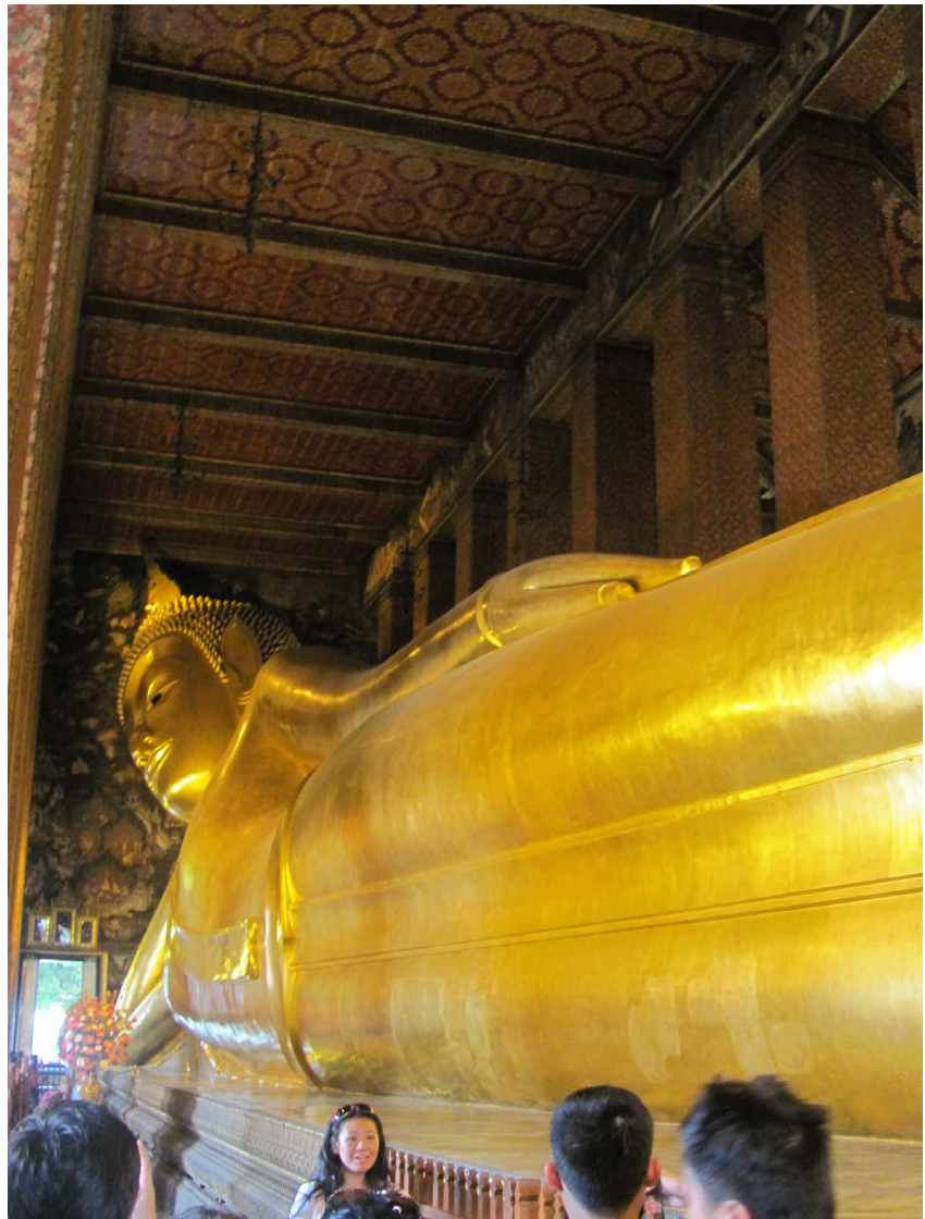
Figure 10. Budda lying down in a Bangkok temple.