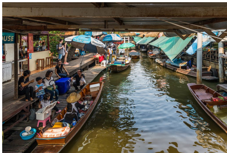
Figure 28. Floating markets on canals.