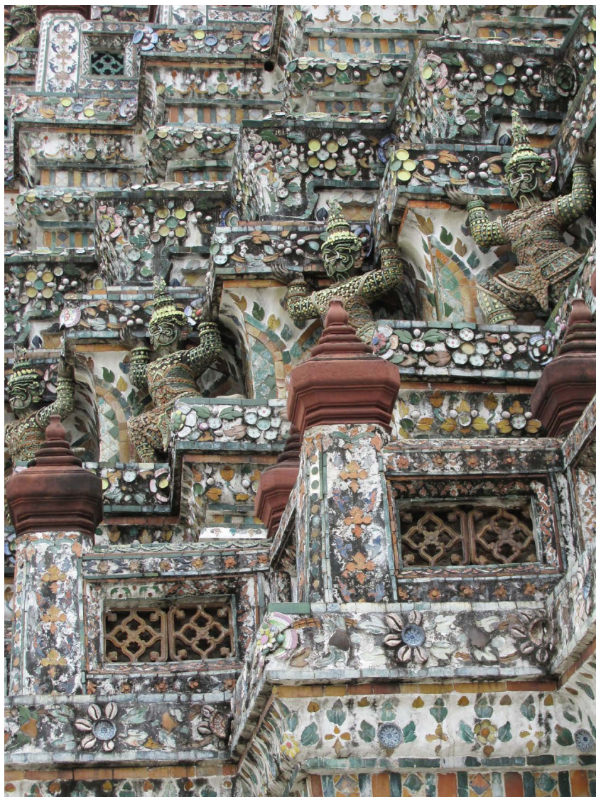
Figure 11. Temple decorations on a Bangkok temple.