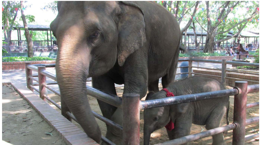
Figure 9. Elephants at the Elephant Zoo.