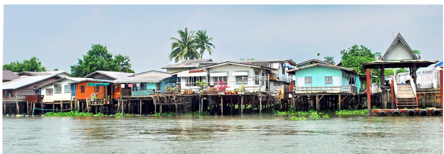
Figure 2. Homes on stilts along the Chao Phraya River.