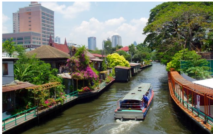
Figure 24. Boat traffic on the canals linked to the Chao Phraya River.

Thep Bridge, trade-in charcoal and others work in rice houses. The loggers and teak traders market their goods around Krung Thon Bridge before it is milled and exported. South of Klong Doei the Chao Phraya River increases in width and banks are covered with greenery ( Figure 24 ). The River banks between Bangkok and Pak Nam are used for commerce. Pak Nam, where many trawlers anchor, has important fish factories, a renowned wat and some good fish restaurants. Klong Doei (Klong Toey) is Bangkok's international port ( Figure 25 and Figure 26 ) where freighters load exports from Thailand. Pak Nam "River Mouth" of the Chao Phraya River is where it flows into the Gulf of Thailand. The 40 km river channel south of Bangkok is lined with harbor installations ( Figure 26 ). The mouth of the channel requires frequent dredging and vessels are limited to 10,000 tons.