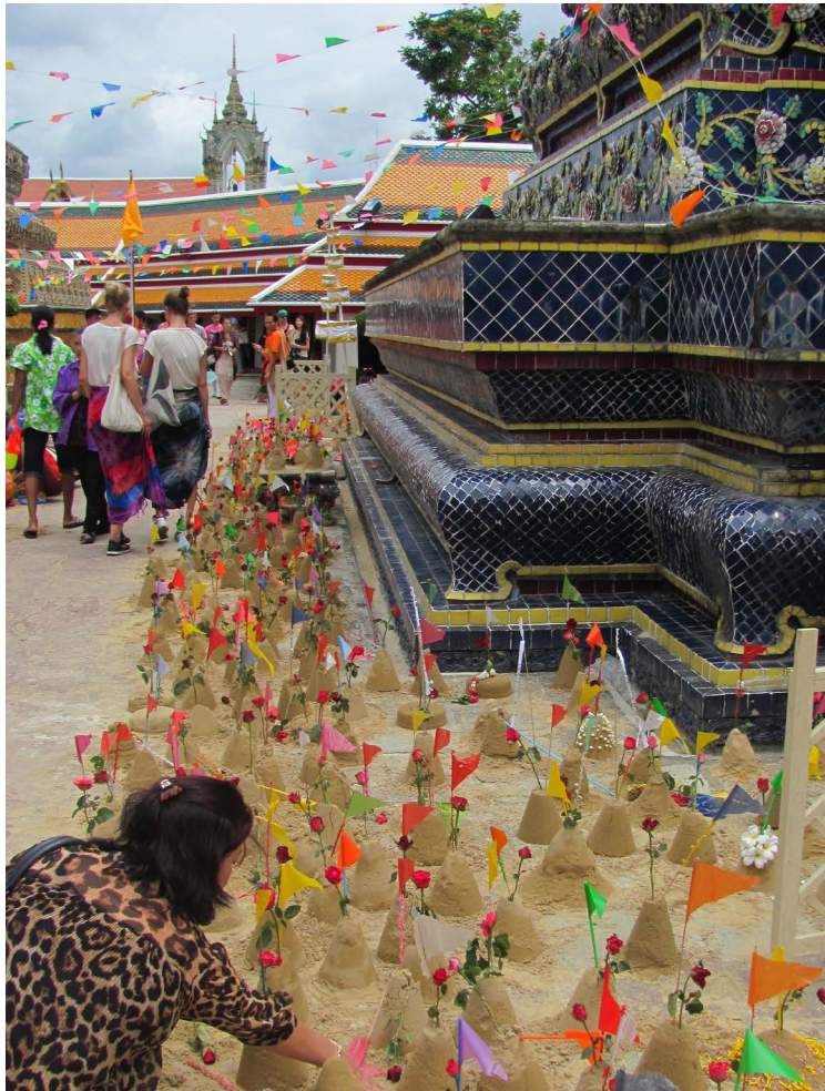
Figure 16. Temples with sand castles in honor of former family members.