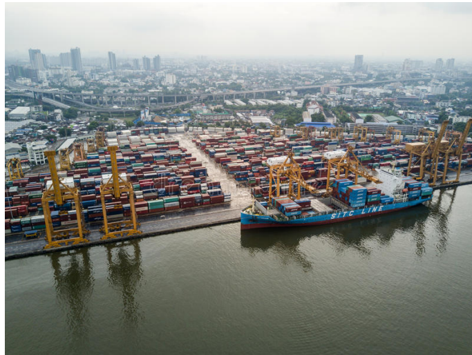
Figure 26. Loaded ship at the Port of Bangkok with City of Bangkok in background.

Land subsidence in Bangkok, Thailand is primarily caused by well pumping and has affected Bangkok for the past 50 years. The impact of the pumping is critical due to the flat low-lying topography and presence of a thick soft lacustrine clay layer which creates foundational engineering problems. Pumping has lowered the water table by as much as 65 m. In the 1980s the subsidence rate was at a rate as high as 12 cm/yr. Bangkok is sinking and could be underwater in 15 years and there is concern that any action taken will be too late.