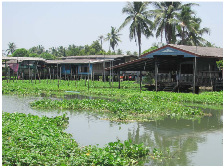
Figure 19. Wetlands and flooding under homes on stilts.