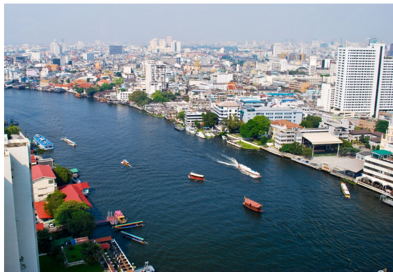
Figure 20. View of blue Chao Phraya River and shoreline can be seen by tourists.