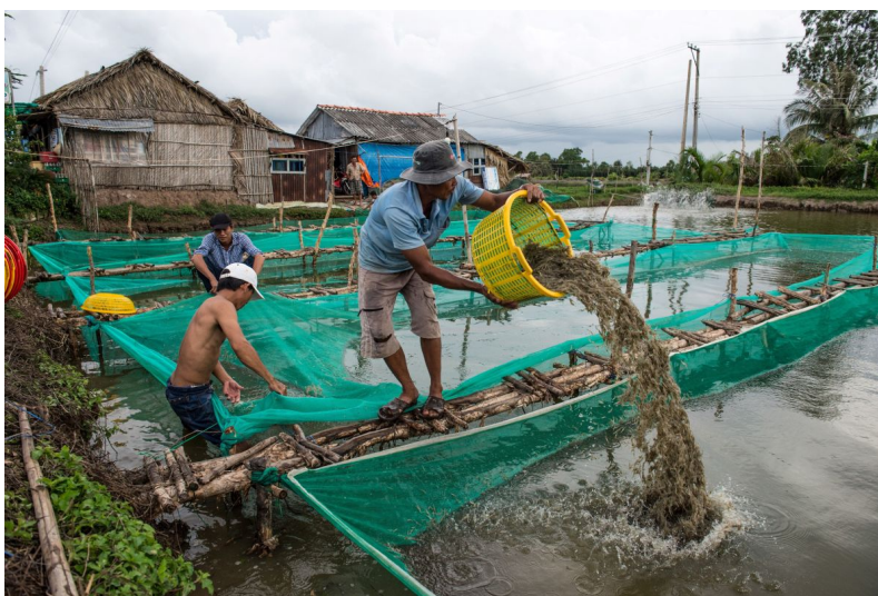
Figure 29. Shrimp farming in Chao Phraya Delta.

estuaries. The primary remaining relic of that original landscape is Khao Sam Roi Yot National Park. The Chao Phraya basin has 280 species of fish. The main stem of the Chao Phraya River alone has 190 native fish species. Extensive habitat destruction (pollution, dams, irrigation and drainage) has occurred. Over-fishing has also been a historic problem. In the past decade, the Thai Pollution Control Department (PCD) has reported that the Chao Phraya River and tributary water quality have deteriorated. The river system contains bacteria and nutrients (phosphates, phosphorus and nitrogen) pollution. Nutrient pollution accelerates algae growth which harms water quality, marine habitats and food resources for aquatic animals [8]. It also decreases oxygen needed for fish survival. The PCD findings rate water quality very poor and large amounts of wastewater were discharged into the rivers from agriculture, industry (Figure 30) and households.