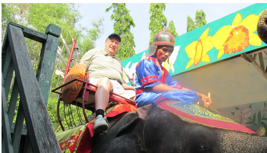
Figure 12. Tourist riding an elephant.