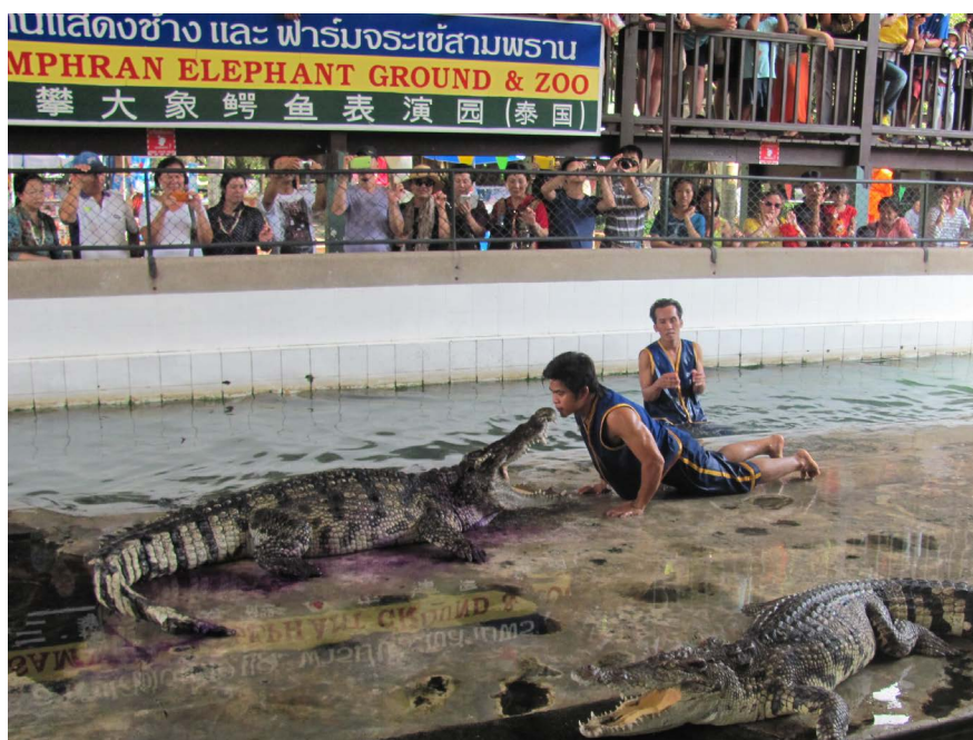
Figure 8. Alligators and handlers at an Elephant Zoo during a show.

Chao Phraya River is a tidal river between Ayutthaya and the Gulf of Thailand. The river ( Figure 7 ) serves as the export pathway for teak and rice. The Thai people have made use of the Chao Phraya and its canal system for fishing, recreation ( Figures 8-16 ), drainage and as the source of water. The Chai Phraya River flows past Chai Nat the home of a government dam and a large irrigation system. The Tha Chin River is the major tributary of the Chao Phraya River ( Figure 6 ). These rivers are interconnected and serve both for irrigation and for transportation.