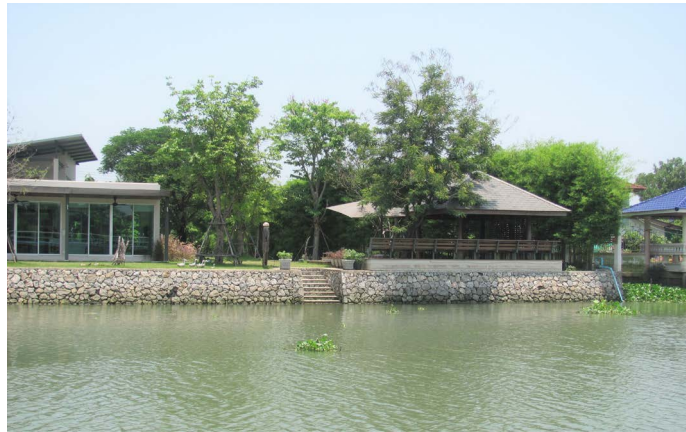
Figure 18. Low floodwall in residential area.