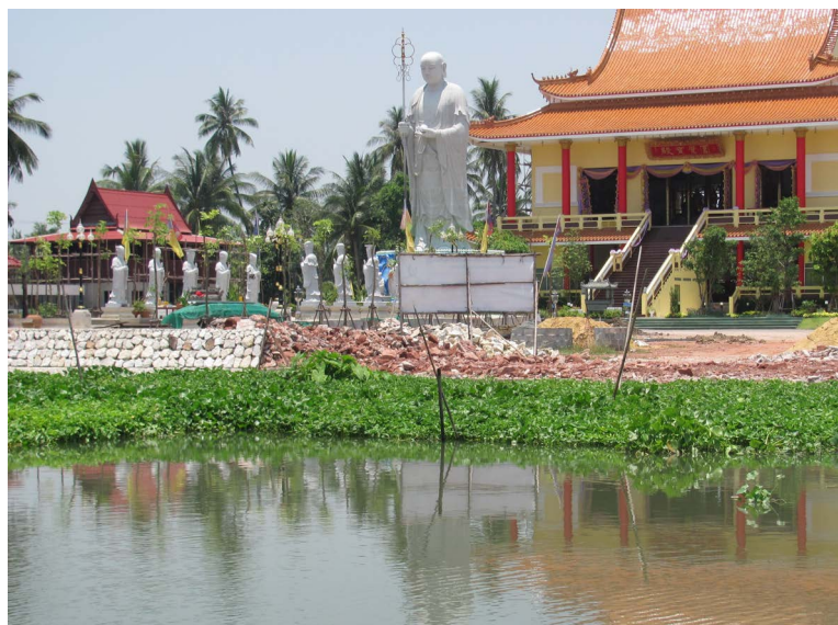
Figure 17. Floodwall repair in front of a Buddhist temple.