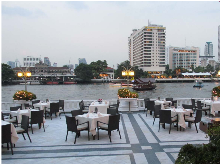
Figure 13. Dining at Oriental hotel along the river.