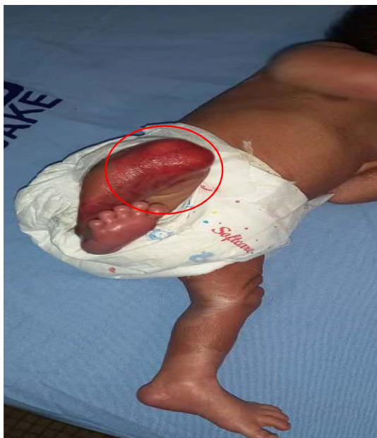
Figure 3. Lesions in the process of healing.

and a non-adhesive dressing. Also, the neonate was seen in dermatology and pediatrics consultation once a week. At the first visit at 14 days of age, the lesion was healing, the bullae had disappeared ( Figure 3 ) and the newborn had no signs of vital distress. At 19 days of life, the neonate was admitted to the pediatric emergency department for poor general impression. The general examination revealed a febrile newborn (temperature 39°C), frank mucocutaneous pallor, tachycardia, hypoxemic tachypnea (SpO 2 at 78% room air). On neurological examination, the anterior fontanel was normotensive, hypotonia was noted with abolition of archaic reflexes. The dressing covering the wound was blood-stained and fetid. The rest of the examination was normal. Management consisted of oxygen therapy by mask, vascular filling with saline. A blood sample was taken for biological assessment (CBC, blood group-Rhesus, thickened drop-blood smear, blood culture, CRP, cytobacteriological and chemical examination of the CSF), and then a biantibiotherapy (cefotaxime + gentamycin) was administered. The wound was cleaned and disinfected with a chlorine-based antiseptic preparation (Dakin Cooper®). The outcome of this neonate was fatal 35 minutes after admission.