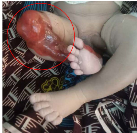
Figure 1. Aplasia cutis congenita of the left lower limb.

There was a dystrophy of the right big toe nail, the rest of the skin was normal and the scalp was macroscopically healthy. No visible malformation was noted. In view of these signs, the management consisted of placing the baby in an incubator, providing sufficient hydroelectrolytes and energy, ceftriaxone and gentamycin-based biobiotic therapy to prevent superinfection, and twice-daily local care with greasy tulle. Additional examinations were then prescribed. Blood count and C-reactive protein were normal. Transfontanelar, cardiac and abdominal ultrasounds were normal. After 3 days, the newborn presented with bullae on the right hand and elbow and on the posterior aspect of the neck, raising suspicion of epidermolysis bullosa ( Figure 2 ). Skin biopsy and histopathological examination of the bullae were not performed because of the insufficient technical picture. The combination of congenital absence of skin on the lower limbs, epidermolysis bullosa and nail abnormality led to the diagnosis of Frieden's type VI ACC, also known as Bart's syndrome. The newborn was discharged on the 7 th day of hospitalization with a satisfactory clinical condition. The mother was given detailed instructions on handling the baby and continuing local wound care with a topical antibacterial cream (2% fusidic acid cream) applied twice daily