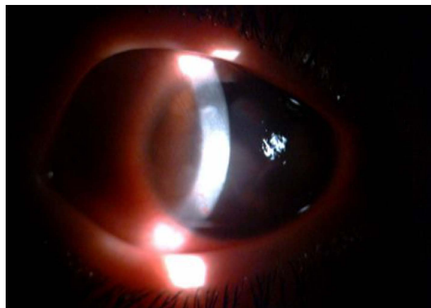
Figure 3. Slit lamp photo of the patient's right eye showing corneal scarring with vascularization.