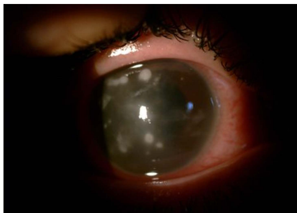
Figure 1. Slit lamp photo of the patient's right eye showing scattered round shaped keratitis patches involving the corneal stroma.

Hypopyon was resolved gradually. The patient showed the improvement of the stromal infiltration over an 8-week period. Topical voriconazole and oral ketoconazole were discontinued. Combination therapy of hexamidine and chlorhexidine in addition to preservative-free lubricant was continued for 6 months with regular monthly follow-ups. The pain settled and the keratitis healed with permanent scarring and corneal vascularization ( Figure 3 ). Vision in the right eye was Hand Motion and a central stromal scar was present after one year follow-up. Prognosis was shown to be favorable after penetrating keratoplasty [11]. Right eye penetrating keratoplasty was performed one year after her initial presentation ( Figure 4 ). Her condition settled well post-operatively and the corneal graft was clear. Her vision one year post-keratoplasty was 20/40 with correction.