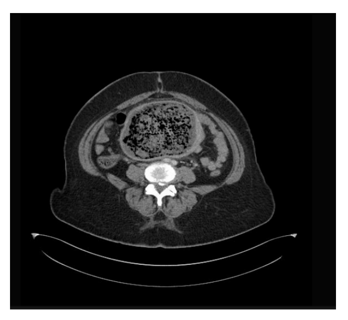
Image 1. Axial view of CT scan showing air collection in uterus, evidence of pyomyoma.