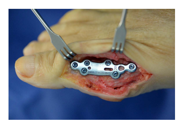
Figure 2. Fusion of the first MTP1 joint with a low profile, pre-contoured, titanium dorsal locking plate of the latest generation. In addition to the material visible on this figure, a plantar metatarsophalangeal screw was placed to enhance stability.