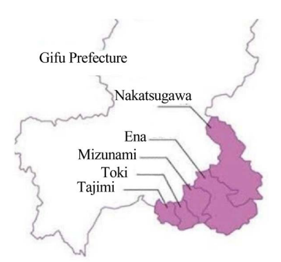
Figure 1. Location of Tono Region.

First of all, when examining the literature, through July 2020, the following databases, Ichushi-Web , the Internet-based retrieval service by Japan Medical Abstracts Society (JAMAS) [8], MEDLINE [9]/PubMed [10], Cochrane Library [11], and Google Scholar [12] were searched by the first author to find additional studies related to the topic, as were the reference lists of included papers and related reviews. Search terms included a combination of keywords by thesaurus, i.e., healthcare provider, history, Gifu prefecture, history of medicine , and Mizunami . The retrieval year was the whole year and the articles published were peer-reviewed.