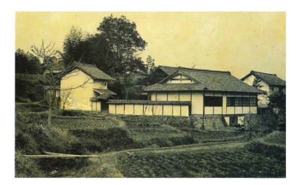
Figure 9. 1904 (Meiji 37th) Practicing medicine at home at Yamada village, Mizunami city [20].

Dentist Yutaro Mizuno (birth and death years: 1897-1967; Meiji 30th-Showa 42nd) graduated from Nagoya Dental School and opened in Kamado village (Mizunami city) in 1918. Detailed information is unconfirmed [19].