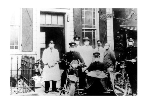
Figure 2. Police station during the smallpox epidemic of 1935 (Showa 10th) [20].

Table 1. Literature on the outbreak of epidemics and healthcare providers who were active, in the Meiji era near Mizunami city.