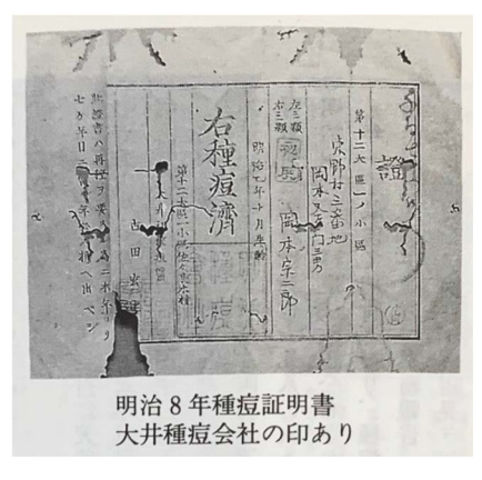
Figure 7. The vaccination certificate with the seal of the pharmaceutical company named Oi Vaccination Company [14].