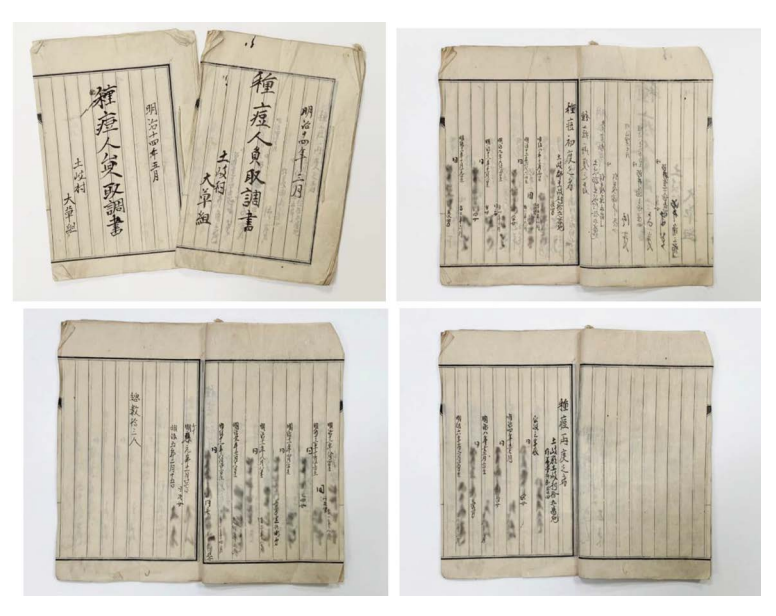
Figure 8. The personnel interrogation report of vaccination against smallpox in 1884. By Okusa Ward in Toki-cho, Mizunami City. Photo by Sinji Sunada, a member of the Mizunami City Board of Education in July 2020. In the document, information on initial vaccination/re-vaccination, surname, date of birth, address, head of household, and relationship is provided. These are unpublished material.