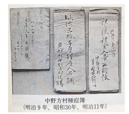
Figure 5. The record book of vaccinations against smallpox in Nakanoho village, Ena city. On the right is an interrogation book for expense for vaccinations, and in the middle is a roster for the vaccination in 1890, which belongs to Nakanoho village [14].