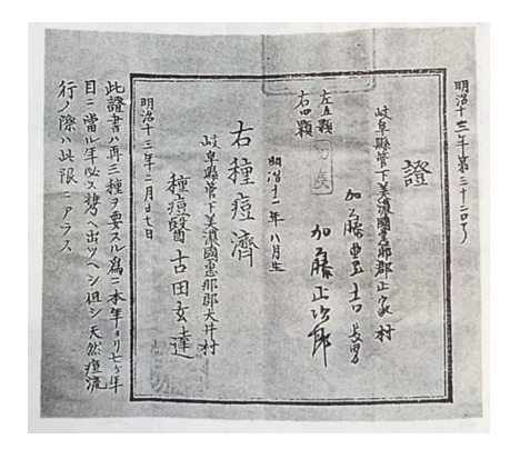
Figure 6. The vaccination certificate in Ena city in 1897. The vaccination doctor is Gentatsu Furuta, however his information is unconfirmed [14].