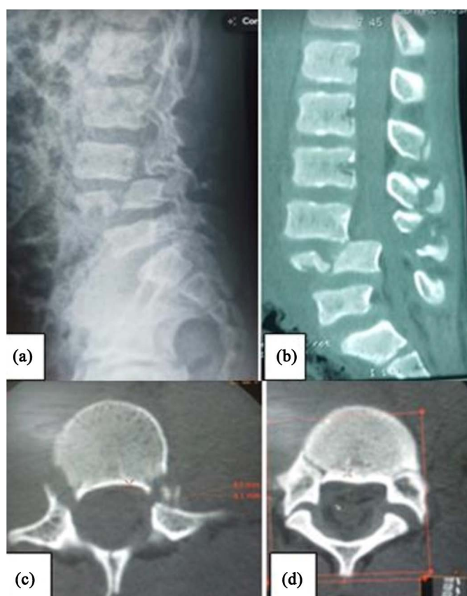
Figure 1. (a) Radiograph of the lumbar spine with lateral view revealed L3 pedicle fracture and complex fracture of L4; (b) Lumbar CT scan in sagittal section showing a complex L4 fracture, spondylolisthesis of L3 on L4 (classified Meyerding grade II), spinous processes L2, L3 and L4 fractures and axial. Lumbar CT scan in axial sections (c) (d) showing a bipedicular fracture of L3 (c) and L5 (d).

Computed tomography (CT) scan in sagittal ( Figure 1(b) ) and axial ( Figure 1(c) and Figure 1(d) ) sections showing a complex L4 fracture ( Figure 1(a) and Figure 1(b) ), spondylolisthesis of L3 on L4 (classified Meyerding grade II) ( Figure 1(a) and Figure 1(b) ), spinals processes L2, L3 and L4 fractures ( Figure 1(b) ); bipedicular fracture of L3 ( Figure 1(c) ) and L5 ( Figure 1(d) ).