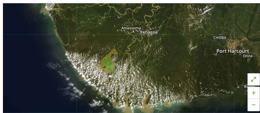
Figure 2. Satellite image of Apoi Creek forest.

The species are being hunted for the purpose of consumption, threat as a result of logging activities and hydrological changes within the marsh forest. Also, as a result of construction activities from the large canals in the region by the oil and gas companies. In addition, dredging of smaller canals for the purpose of transporting the logged timbers poses threat to this species of monkeys. Apoi Creek Forest Reserve is said to have been misused or neglected by the Bayelsa State Department of Forestry which is under-funded by the state government and lacks the resources to protect it effectively [15]. Presently, the site is being managed by several communities that surround the site: Apoi, Gbanraun, Kokologbene, Lobia and Okubie. The biodiversity value of this site is recognized universally due to the IUCN recognition for its endemic species like the Niger