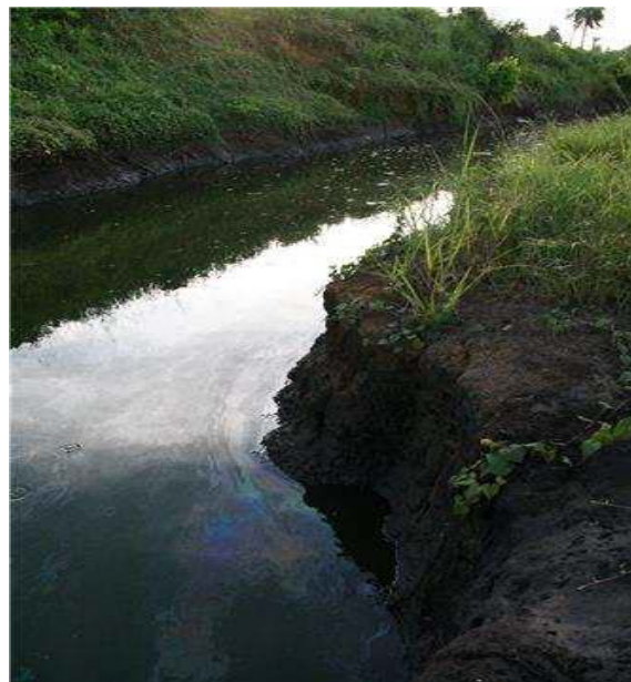
Figure 3. Oil spill in water body.

Wetland degradation is known to exist in the form of over-utilization of its resources, clearing of vegetation for agricultural purpose, sand filling of wetlands for the purpose of construction and installation for industrial facilities, etc. All these bring changes to the natural state of wetlands by impacting the fauna and flora of the wetland system. According to [2] wetland loss can be defined as the loss of wetland areas due to the conversion of the areas to a mainland for the purpose of agriculture, development (urban expansion) etc. Wetland loss could also be referred to as modification of vegetated wetland to upland areas or to inundated environment that originally sustained organism that are dependent of wetlands. Wetland degradation is said to be the deficiency of wetland due to human activities. However, wetlands are considered to be lost if they have been degraded to the level that they have no substantial natural values and functions.