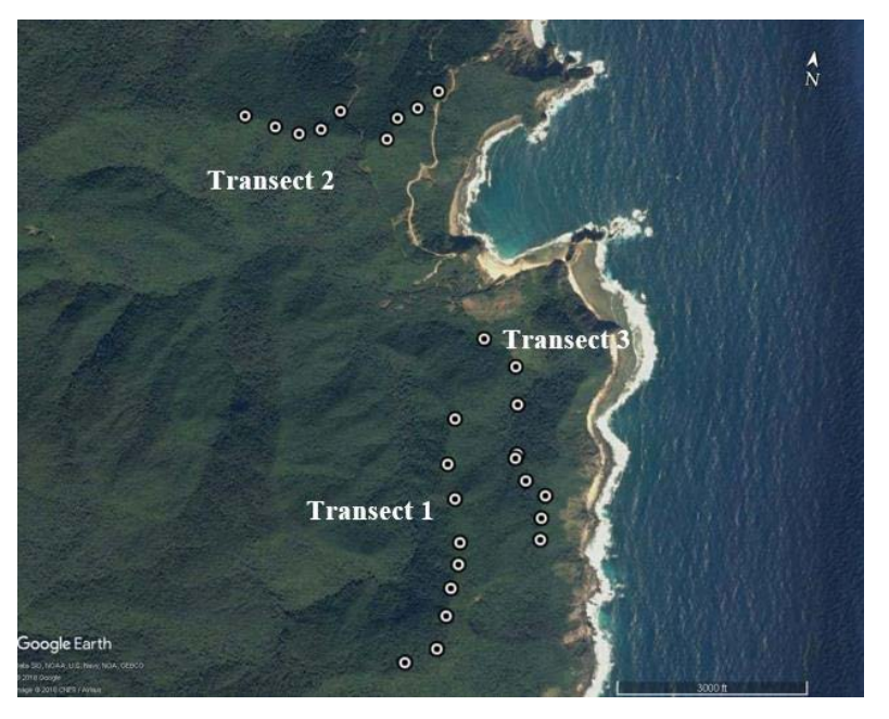
Figure 1. Location map of the transect and quadrat established in Sitio Dicasalarin.