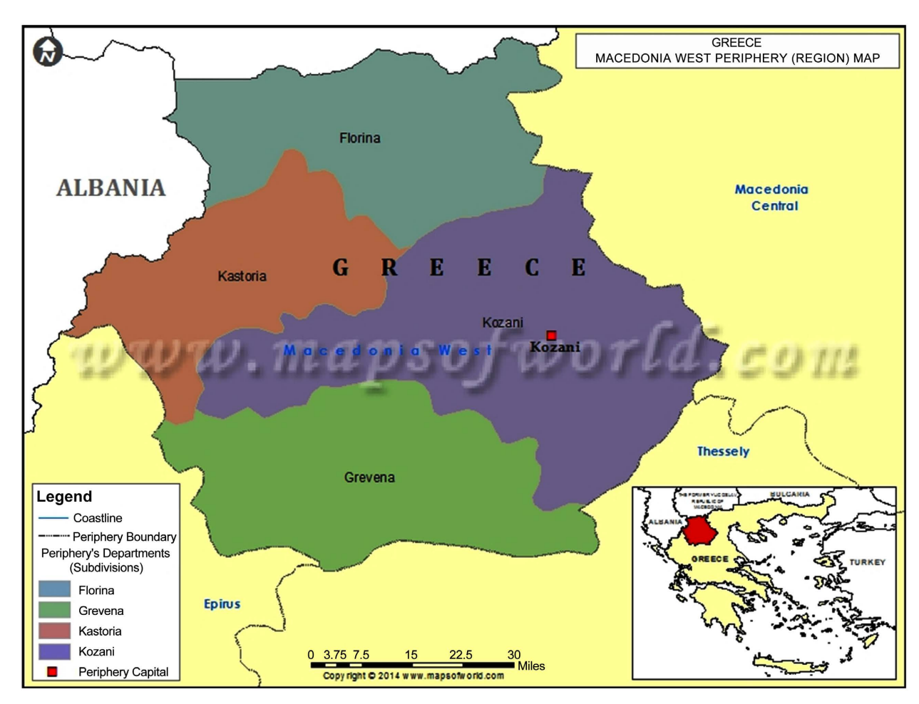
Map 1. Geographical position of western Macedonia in the Greek territory (<a href="https://www.google.com/search?q=Maps">https://www.google.com/search?q=Maps</a>).

In summary, the key factors influencing the development of the industry are Political, Economic, Sociological, Technological, Legal and Environmental that influence an economic sector from the external environment and essentially guides decision makers to identify the external factors that affect the economic sector (Dagkalidis, 2012).