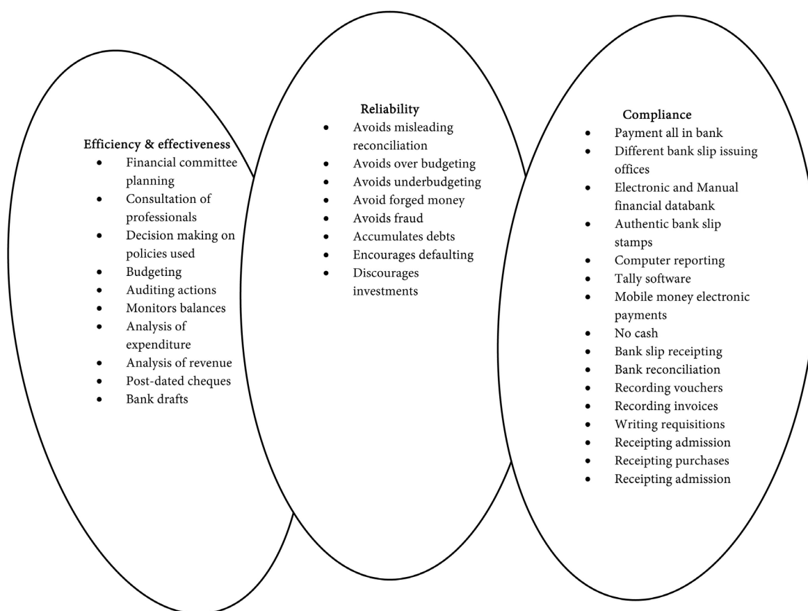
Matrix 1. Summarised codes embedded in preventive financial control used in private schools' revenue mobilization.