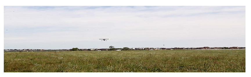
Figure 6. Video recording aircraft operations and landing.