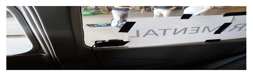
Figure 7. FAA classification as experimental aircraft.

located 14 miles northeast of Colorado Springs, Colorado. During the testing period, which lasted 44 minutes, four separate takeoffs and full-stop landings were made. While in cruise configuration, the aircraft reached airspeeds of 110 miles per hour (mph). The aircraft crew consisted of one pilot and one instrument technician. Weather conditions throughout the period of testing were sky clear, winds out of 182 degrees at 15 to 17 mph, gusting to 30 mph.