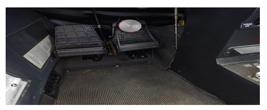
Figure 4. Brake force measured and recorded.