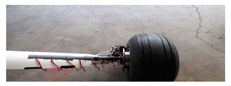
Figure 3. Instrumentation and telltale's record attitude and airspeed.