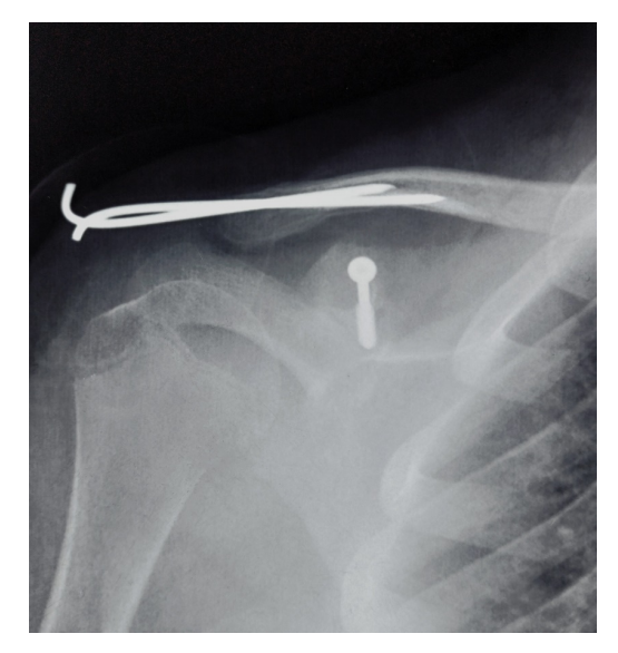
Figure 2. Post-operative X-ray showing the reduction of the fractures fixed by K-wires in the clavicle and a screw in the coracoid process.