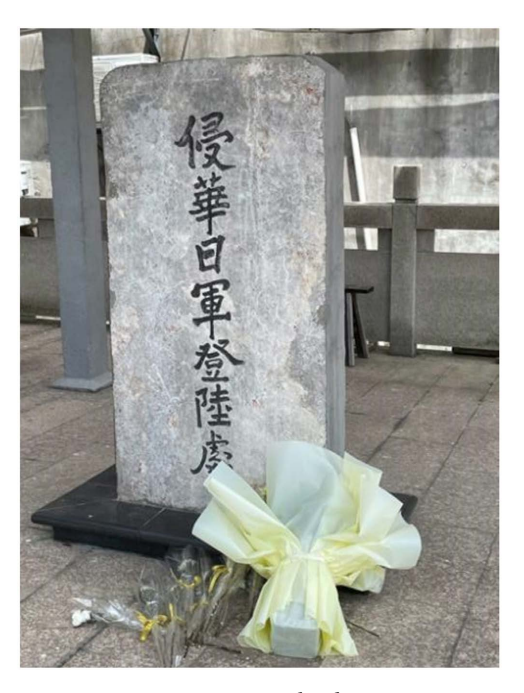
Figure 1. Japanese invasion landing site.

ularly attractive "hundred people pit site" and "Pinghu invasion of Japan landing site" (Figure 1), but the actual site, these sites are gone, only a pavilion left! Only a pavilion is left standing on the seashore. There are no care measures around the site, the road is not convenient for traffic, and there is no relevant red history introduction signboard local protection and development of the site is not obvious, in sharp contrast to the red study base in Nanhu District. (Figure 2) Research camp infrastructure facilities are not complete, low attention outside the