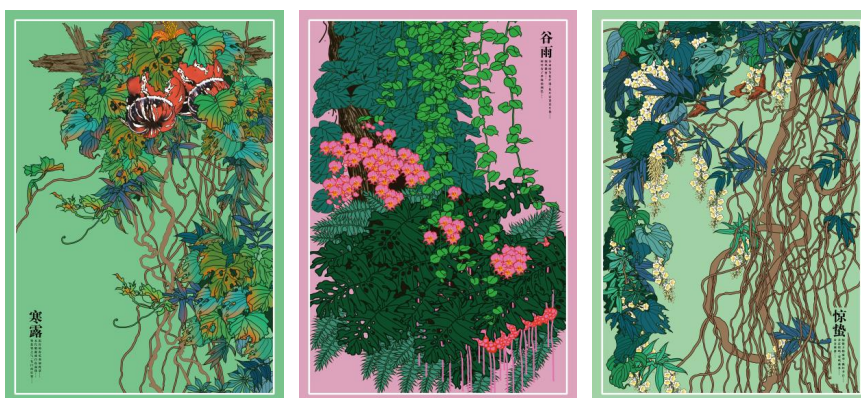
Picture 1. The author's self-drawing-illustration (cold dew, grain rain, Jingzhe).

The combination of Chinese painting and illustration design can innovate design concepts and enrich design elements and styles. This paper uses simple lines, bright color collocation, and scientific composition to show the illustration scenes in the 24 solar terms, which is a tentative and innovative design of Chinese style illustration. Picture 1 and Picture 2 show the artworks personally designed by the author.