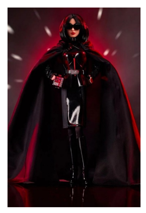
Figure 3. Darth Vader Barbie, a classic star wars character (Source: Internet).

After the release of Frozen in 2013, princesses Elsa and Anna quickly became girls' favorite toys. In 2014, a survey by the American Retail Federation showed that about 20% of parents were willing to buy the new princess toy for their daughter, surpassing Barbie to become the most popular toy for girls.