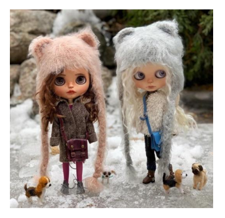
Figure 5. Blythe clothes design works.

consideration for the need of clothing to be warm in winter and cool in summer, which greatly broadens the scope of clothing design.