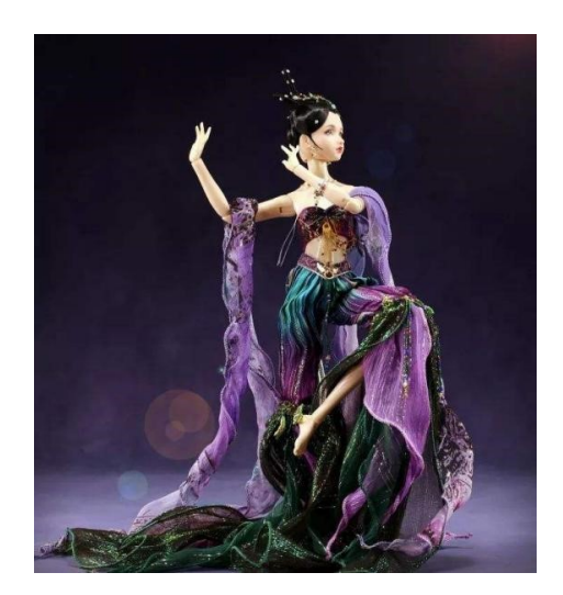
Figure 1. Bedoll (Source: Internet).