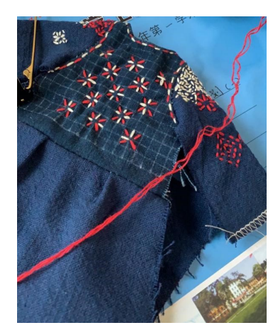
Figure 7. The process of embroidery (Source: Photo by author).