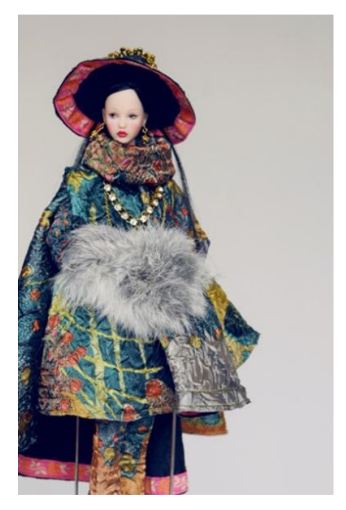
Figure 2. Kissmela.

market space, and a large part of the doll mother is a group with leisure and money. Its momentum can be seen from the auction of doll and doll clothes. In addition to the doll's creators, its derivative markets include doll hairstylists, makeup artists and clothing designers in short supply, especially those in the forefront of technology often use registration-lottery-queuing or appointment system, and the waiting period is calculated by years, which shows the degree of popularity. The mainstream culture is dynamic, which makes it possible to transform some forms of youth subculture into mainstream culture [5]. The active market of doll clothes fully indicates that there are still many explorable directions for clothing design in the subcultural perspective, and there are broader