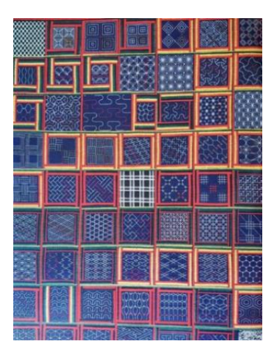
Figure 6. Embroidery part of the stitch (Source: Photo by author).