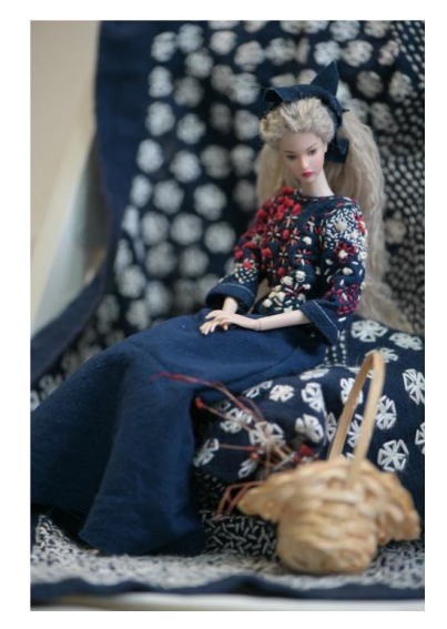
Figure 8. Finished doll clothes (Source: Photo by author).