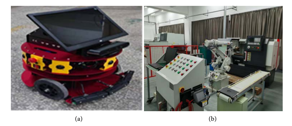
Figure 2. Two types of complex environment robots used in robotics teaching. (a) CNC machine manipulator; (b) service robot.

is a dynamic and unstructured complex environment, in which the precise guidance technology of the robotic arm end based on multi-sensor information fusion is the core technology of the robot system. To complete complex tasks, the robot must have the perception ability of the external environment. The guidance technology based on multi-sensor is to improve the intelligence level of the robot by using sensors such as vision and inertia.