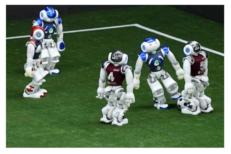
Figure 1. RoboCup competition.

originated from academic research, has gradually exerted a growing influence on university engineering education. At present, the competition is the most authoritative robot competition in the global robotics academic field. The Junior Robot World Cup, which began in 2000, has also begun to have a profound impact on technical education in primary and secondary schools. In 2013, the World Association for Robotics in Education launched the World Competition for Robotics in Education.