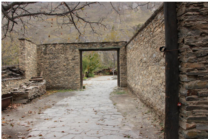
Figure 5. Taoping qiang village road.

changes, appeared the tendency of homogeneity, cookie-cutter houses become a common phenomenon, be badly in need of Learn to improve, reasonable choice, inherit the body of the scientific part, such as cover building drive ventilation, can be re-recognized and utilized. Figure 5 shows a road of Taoping Qiang Village.