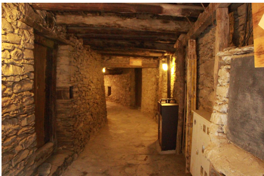
Figure 2. Ground road network of taoping qiang village.

Since the 5.12 Wenchuan earthquake, the earthquake has not only brought losses but also promoted the upgrading of Qiang people’s dwellings. Compared with the plain area and the eastern coastal area, the development of rural areas in