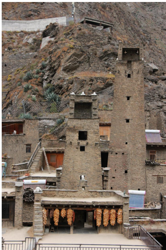
Figure 3. Diaolou of taoping qiang village (Photo by the author).

Due to peach QiangZhai belongs to the seismic intensity big, steep slope, the surface broken, earthquake, mud-rock flows, landslides and floods are common in the region, see more of the disaster, under the influence of the objective conditions, some working or financially wealthy family, moved away from here, make the settlement of population loss, thus lost the population base. As a result, the integrity and vitality of Taoping Qiang settlement culture are reduced. When the modern way of life did not enter the Qiang area, the characteristics of settlement were in groups, and the phenomenon of population loss was almost non-existent. The modern way of life in Qiang has changed this balance. Its unique clustering characteristics also lost its original significance.