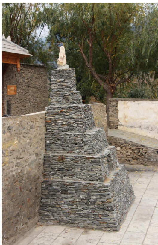
Figure 1. Taoping qiang white stone.

Through the precipitation of history, Qiang village has formed such unique regional architectural cultures as Qiang blockhouse defense culture, white stone religious culture, cattle and sheep wealth culture ( Figure 1 ), and stone construction culture, which make its residential buildings with distinctive features. Taoping Qiang village buildings are built by hand with soil and pieces of stone by digging holes to put up wood and setting up columns against walls [4]. The whole village is integrated at one go and is a representative of stone blockhouses in Qiang area. The underground water supply system in Taoping Qiang village is the most mature and representative water system in Qiang region. It has the function of defense, fire fighting and “natural air conditioning”. The unique three-layer transportation network of roof, street and underground water network in Taoping Qiang village constitutes its unique military defense system and three-dimensional transportation network. Taoping Qiang Village has a strong “centripetal force”, which is a typical “point” type of aggregation [5]. The Qiang