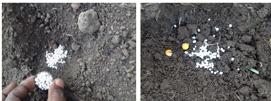
Figure 1. Micro dosing and localized placement method used during seeding.

The following data were collected from the two middle rows of each plot: emergence rate, collar diameter, plant height, plant aspect, days to 50% flowering (pollen), harvest rate, ear length, ear diameter, ear aspect and yield. The emergence rate was determined by the ratio of number of emerged plants/number of