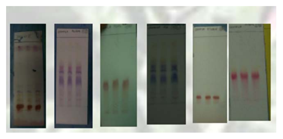
Figure 3. TLC of both cultivars (spots from left to right: under ordinary light; AlCl<sub>3</sub>; FeCl<sub>3</sub>).

that complete separation of anthocyanidins with closely related R_f values is difficult, and two-dimensional TLC may thus be preferable [18].