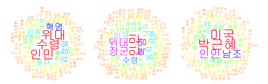
Figure 1. Wordcloud map of North Korea political data.

Figure 1 is the result of the data from 2008, 2012, and 2017. It can be intuitively seen that the core words with the highest frequency of occurrence in each year are different. It can be analyzed that the news of each year is very obvious. Among the 2008 news data, the words such as "Leader", "Great", "People", "Revolution", and "Kim Jong il". The words with higher frequency in 2012 are "People", "Revolution", "the United States", "Kim Jung-un", "Construction". In 2017, the core words with high frequency are "Park Guen-hye", "the United