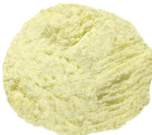
Figure 1. Sulfur at room temperature.