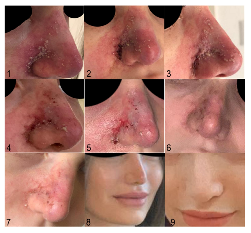
Figure 2. An example of post dermal filler injection vascular occlusion. 0.6 cc of Hyaluronic acid dermal filler was injected on the dorsum and tip of the nose. 1: 4 days post injection. 2, 3: 6 days post injection. Hyaluronidase injected, 4: 8 days post injection. 5: 10 days post injection. 6: 12 days post injection. 7: 14 days post injection. 8, 9: full recovery 3 weeks post injection.