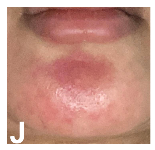
Figure 4. Full recovery 11 days after procedure.

management is crucial to handle such cases aiming at full recovery. In both cases detailed before, vascular occlusion happened, on the nose in case 1 and on the chin in case 2, despite taking all precautions. Immediate response using the treatment protocol led to full recovery in both cases.