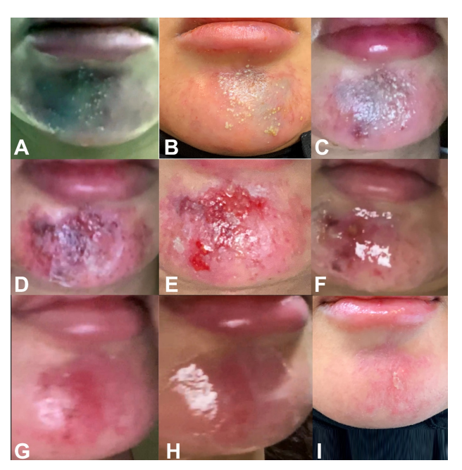
Figure 3. An example of post dermal filler injection vascular occlusion. 1.5 cc of Calcium Hydroxyapatite dermal filler was injected on the chin mixed with 0.5 cc Lidocaine 2%. (A) (B) 2 days after procedure, Hyaluronidase injected, ((C), (D)) 3 days after procedure, Hyaluronidase injected again, (E) 4 days after procedure, (F) 5 days after procedure, (G) 6 days after procedure, (H) 7 days after procedure, (I) 8 days after procedure.