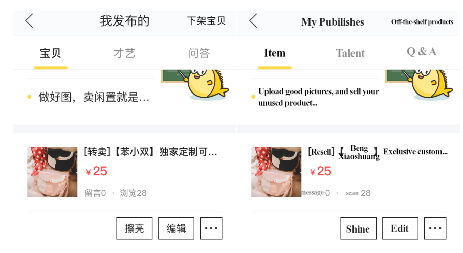
Figure A3. Xian-Yu mechanics: "Shine" the goods.