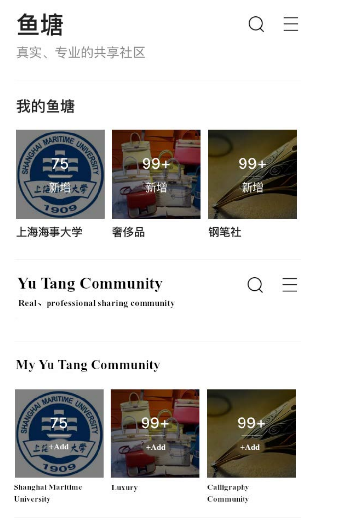
Figure A4. Yu-Tang: Xian-Yu's user communities.