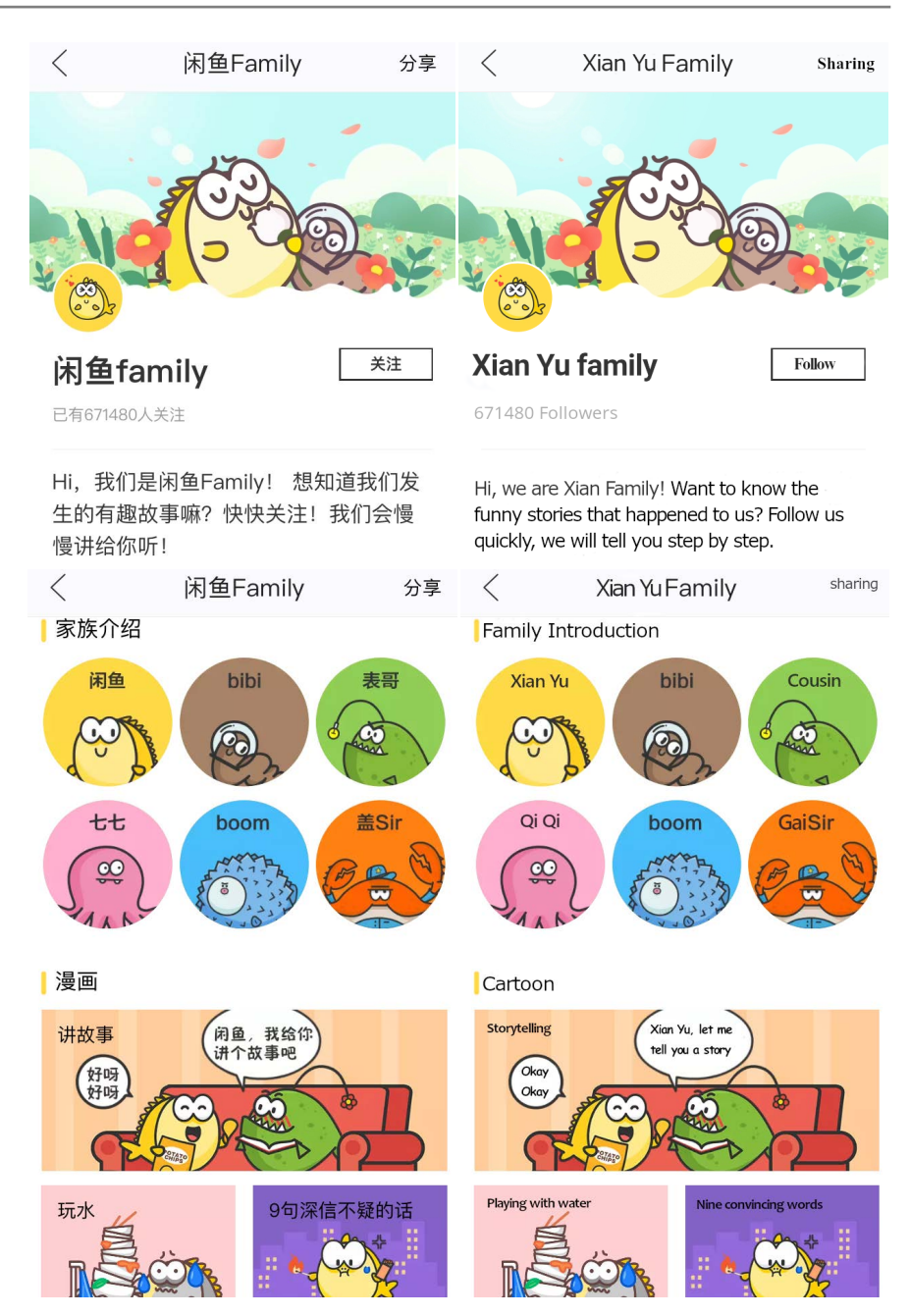
Figure A5. Xian-Yu family and comedy.