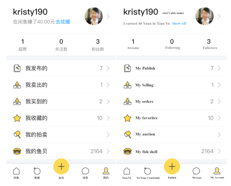
Figure A2. Xian-Yu mechanics: seashells, fans, thumbs up.