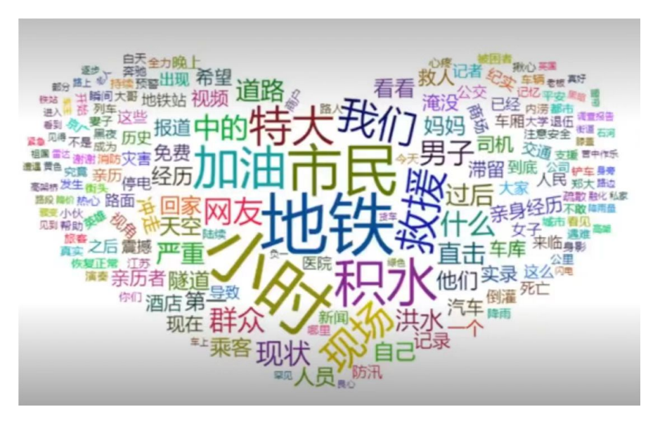
Figure 1. 720 event b station video title high frequency words word cloud map.

the No. 5 subway tragedy that occurred during the 7.20 rainstorm in Zhengzhou caused a great deal of controversy and reflection among the general public. b) The waterlogging has caused a general bad impact on the lives of the public. c) The importance and urgency of time in the face of natural disasters. d) In the face of such a serious natural disaster, the video platform also played an active role in spreading positive energy and updating rescue messages in a timely manner.