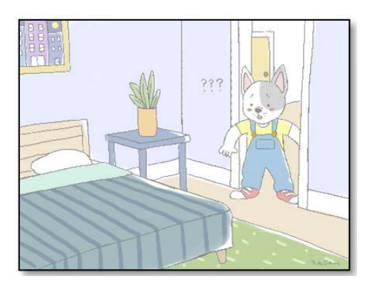
Figure 4. The central character, "Rocko" in Rocko's guitar.

This theme is also identified under the C-FRACS, Gatekeeper Communication Protocols (Figure 2, [C]): "abstain" or abstaining from discussing the truth. This construct represents how some caregivers abstained from truthful discussions and may have used "indirect" or even deceptive means of communicating with children about parental incarceration.