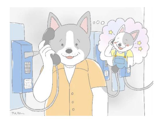
Figure 7. Rocko and dad speak by telephone.

For example, in the book, Rocko's Guitar (see Figure 7), the dad is depicted talking on the pay phone from the prison. This illustration aligns with the literature that recommends that authors should avoid depicting parents in a negative light where children might fear for their parent's safety (Larsen Walker et al., 2020). The authors/researchers refrained from using frightening illustrations, dark images, and threatening environments that might add to children's worries and concerns.