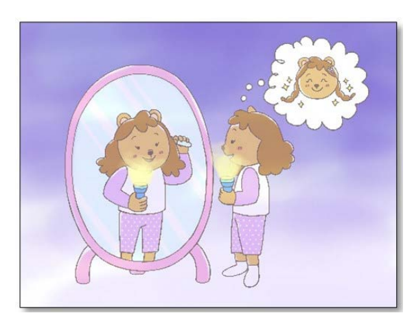
Figure 5. Central character "truth," in, truth and the big dinner.

Support Systems, role clarity, role ambiguity, and communication strategies.