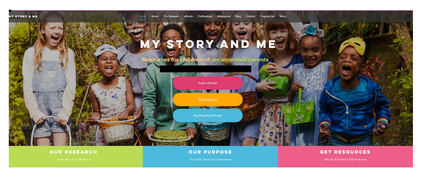
Figure 6. My story and me web portal.

We selected a user-friendly name, "My Story and Me," as a masthead that represented the web-based content. This name was conjectured to be inviting and would enable users to feel a part of the project as well as feel comfortable accessing the tools and resources on a platform that was not highly technical. Child-friendly depictions of diverse children drawn from stock images were used to capture the essence of child-friendly resources.