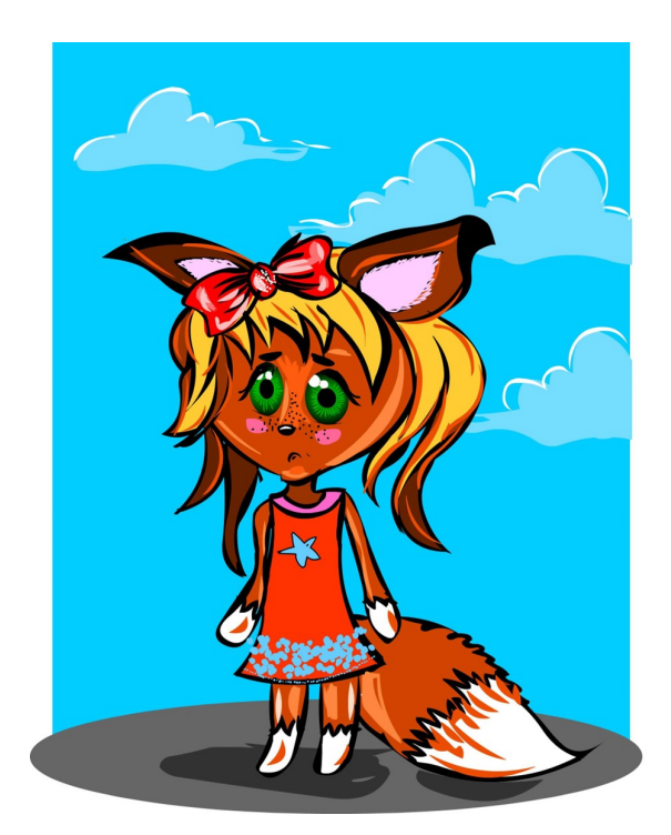
Figure 3. Central character of baby star finds "happy".

Caregivers posited that in such cases, it is difficult for young children to adjust even if they have a supportive caregiver. The caregivers divulged that children under their care often felt a sense of guilt and responsibility for their parent's arrest and incarceration, as if it was their fault. This sentiment is expressed through one caregiver's recommendation shared with focus group members: