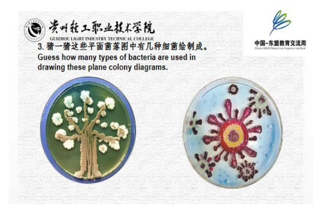
Figure 3. Microbial fermentation.

Thirdly, the spread of activities has promoted the internationalization of education. The project has been approved by 17 colleges and universities this year. Each college chooses its own regional discipline characteristics and regional culture advantages to design the project. Guizhou Light Industry Technical College chose the professional cultural knowledge of batik, fermentation and tea culture. As shown in Figure 5 , the batik cultural practice conducted by international young students after the batik course has recently been displayed ( Figure 6 ). This kind of cultural project activities guide the students to acquire cultural information, carry out cultural practice, form cultural concepts and cultural awareness through the way of "theoretical explanation + practical training activities + product production", and then become the promoters and disseminators of Guizhou culture, Chinese culture and local culture, as well as the builders of cultural bridges between China and foreign countries.