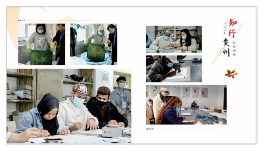
Figure 5. Batik culture practice.