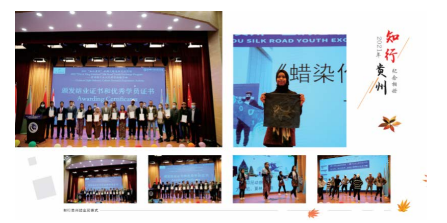
Figure 7. The closing ceremony of the programme.

First, international projects need to focus on all departments and functional departments of the college. The College has set up project leadership group, teaching group, student volunteer service group, reception group, logistics and security group, propaganda group and student special press corps. Among them, the teaching group is responsible for the arrangement of teaching activities and daily teaching management. The student service group is mainly responsible for the education of laws and regulations, daily assistance and so on. The reception team is responsible for transportation, meals, finance, coordination and communication. The logistics and security team is responsible for the news publicity and media coverage of the event.