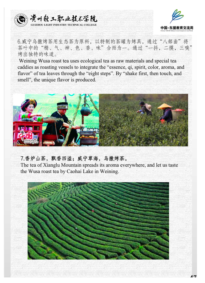
Figure 2. Tea culture experience.

Through the participatory observation, this activity based on Guizhou specialty industries and the advancement of the school, has a careful design for the short-term cultural exchange research activity with the framework of light industry culture research experience. Through contact and recruit, there are 17 international youth and 5 team teachers participating in the activity from Jiangsu Food and Drug Vocational and Technical College, Zibo Vocational College, and Guizhou Minzu University and different countries including Bangladesh, Indonesia, Laos, Yemen, Uzbekistan, Kyrgyzstan, Kazakhstan, etc. And they personally feel the traditional Chinese cultural charm of Guizhou Jiang-flavour Spirits culture, batik crafts, and tea culture. They can experience the spirit of the Guizhou craftsman and perceive the humanistic ecology of unity of "Zhi & Xing" in Guizhou to enhance each other's friendship.