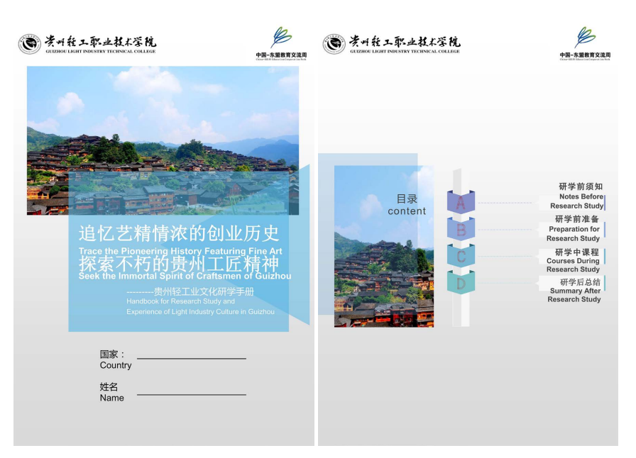
Figure 4. The cover and contents of the Handbook for Research Study Experience.