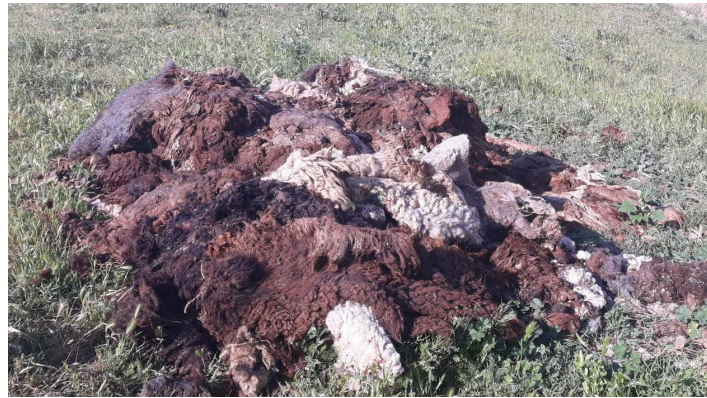
Figure 1. The process of sorting wool according to texture and color after cutting.