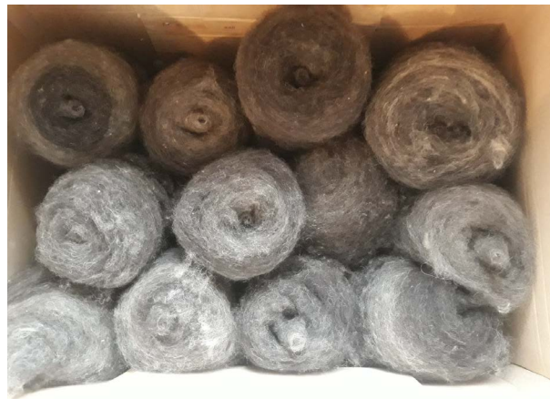
Figure 2. Washed, straightened and rolled wool after cutting.

The Kyrgyz people are well aware that sheep's wool also has anticoagulant properties. When a sheep's wool is burned, it releases a substance that has the property of thickening the blood. Thus, in the late nineteenth and early twentieth centuries, Kyrgyz traditional medicine was limited to natural medicines and existed in harmony with nature, closely related to the Kyrgyz people's philosophical worldview and ethical concepts.