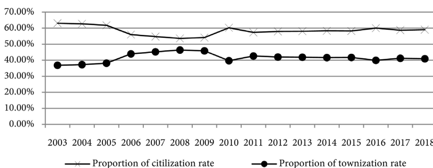
Figure 2. Changes in the proportion of “citalization” and “townization”.