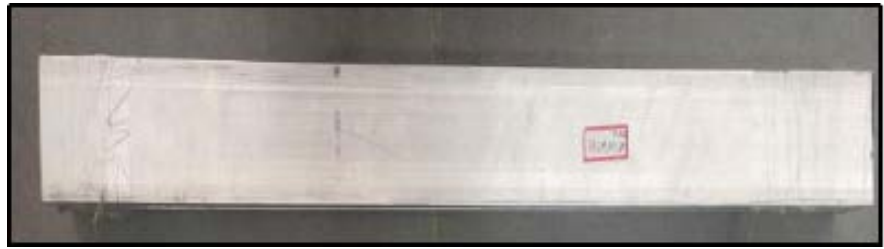
Figure 1. Structural aluminium.