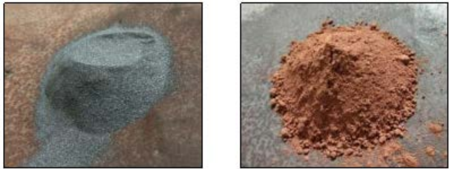
Figure 2. Boron carbide & red mud reinforcement.