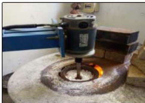
Figure 3. Electrical induction furnace with stirrer.