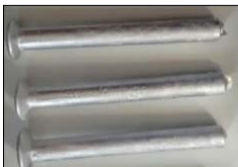
Figure 4. Test specimens.

engineering systems. Frictional resistance between the contact surfaces causes wear on the surfaces which results in the cumulative loss and deformation of the material. Pin-on-disk tribometer, as shown in Figure 5 is the standard test instrument (VER02 Computerized Pin on Disc Wear Testing Machine, Bangalore) for the assessment of friction, wear rate and wear resistance. Wear samples (10 mm × 10 mm) and testing were carried out according to ASTM G99 standard. A pin is loaded against a flat revolving EN31 steel disc and the wear track diameter is set to 60 mm.