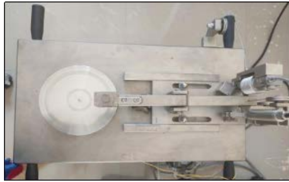
Figure 5. Pin on disc tribometer.