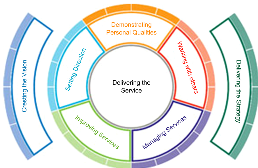
Figure 2. Clinical leadership competency framework.

There are five domains in the MLCF/CLCF—Demonstrating Personal Qualities, Working with Others, Managing Services, Improving Services and Setting Direction. Reflecting on the leadership competencies outlined in the MLCF/CLCF, it seeks to support clinicians develop the knowledge, skills, attitudes and behaviours required to be effective and emotionally intelligent team players; support others through their leadership roles, and make influential contributions as appropriate. Subsequently, the framework was adopted as the “Leadership Framework” for all health professionals working at NHS, within content for the primary five domains but with two additional domains as suggested by the NHS Leadership Academy for those working at senior levels in organisations (NHS Institute for Innovation and Improvement and Academy of Medical Royal Colleges, 2010). Therefore, it is fair to say that the CLCF supports clinicians in developing the leadership competencies that they will require in practice in their current work and at later stages in their careers as shown in Figure 2 .