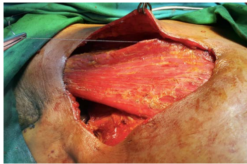
Figure 2. Padding of chest sector.