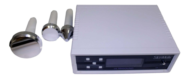
Figure 2. Elegans Ultrasonic Sonophoresis.

NIR is most commonly used for skin rejuvenation as it accelerates healing and promotes healthy cellular function through a reduction of inflammation and optimization of skin immune responses [10] [11]. BL is an effective adjunct in the