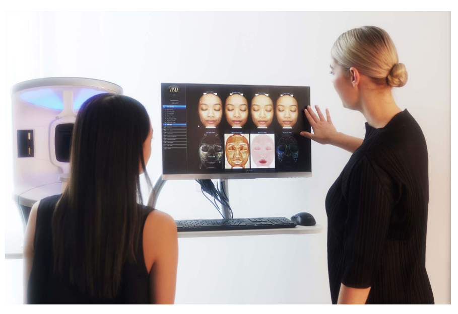
Figure 1. Visia skin analysis system (Canfield, NJ, USA).

All facial rejuvenation treatments possess an array of contraindications or precautions, which the therapist must understand prior to the application of modalities and pharmacologic agents. Whilst many of the precautions are general, some are more specific to the modality selected. See Table 1 .