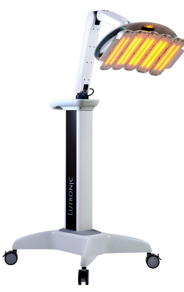
Figure 3. Healite II (Lutronic, South Korea).

treatment of acne due to its ability to normalise skin microbiota, particularly the pathogenic over-colonisation of C. acne [12].