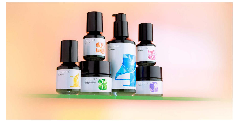
Figure 5. The RATIONALE Essential Six (RATIONALE, Victoria, Australia).